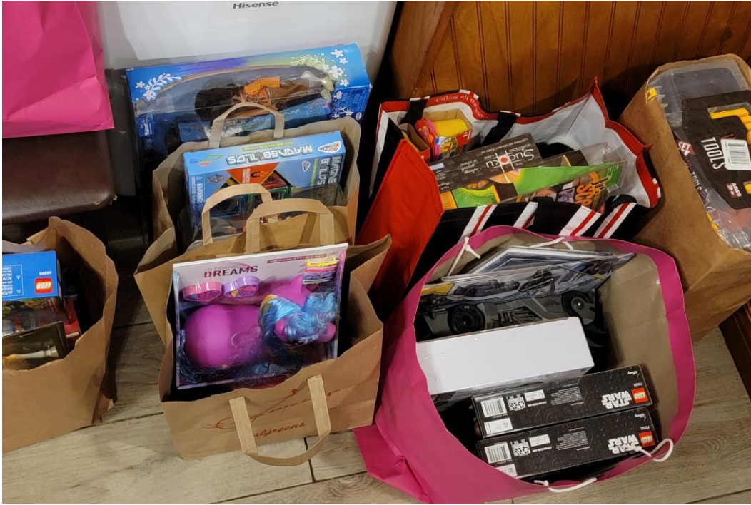
Figure 4 Part of the donations for Kindness 4 Kidz.

For information contact Gene Thornton at Genethornton@Comcast.net or call 302 355 1655.