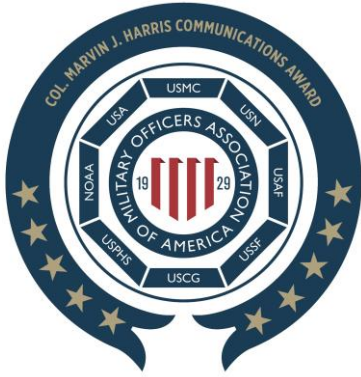
Figure 11 5-stars for Communication via website, 2d year, Webmaster Kerry Brooks.