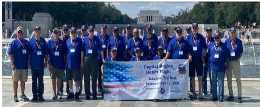
TOP- A total of 24 veterans from Delaware took part in the first Honor Flight on Sept. 12 to see the war memorials in Washington.