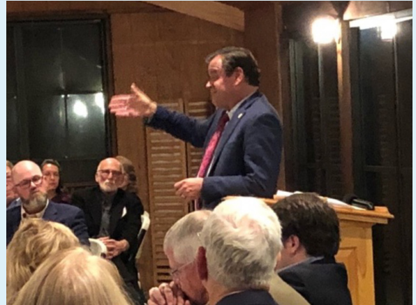
VA Assembly Delegate Keith Hodges informs the assembled guests of political happenings in Richmond