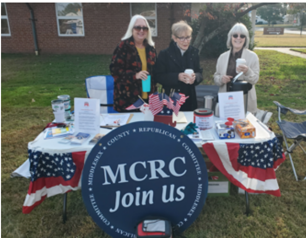
The Republican Ladies of Urbanna at their post on Election Day