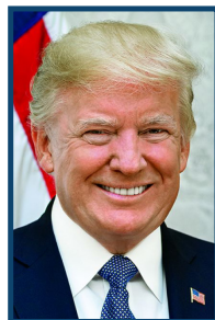
Donald J. Trump Republican Winner Republican Presidential Primary March 5, 2024