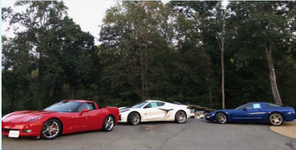
American-made red, white and blue Corvettes reinforce the 2023 MCRC fundraiser, Red, White and Blue Meet the Candidates event

The annual Red, White and Blue event held last summer was a huge success! While pictures don't do the event justice, below we have a few shots from behind-the-scenes and at the event itself.