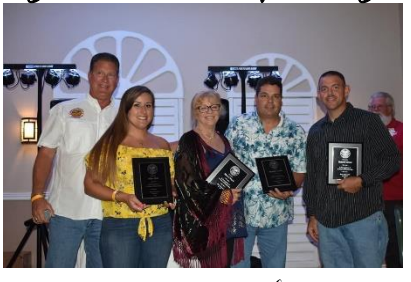
10 year members