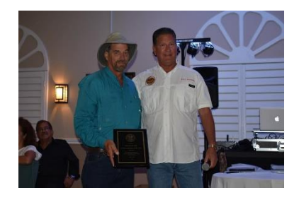
Conservationist of the Year