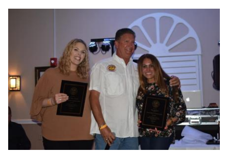
Conservation Communication Award