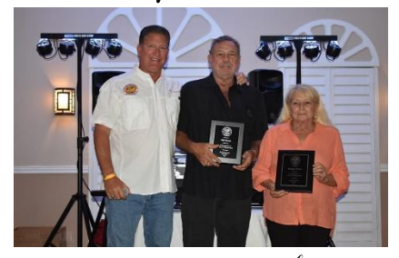
5 year members