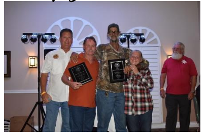
Our newest Life Members