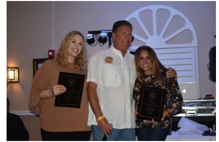
Conservation Communication Award