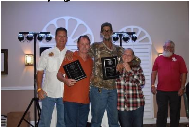
Our newest Life Members