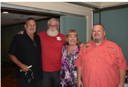
Our Board of Directors