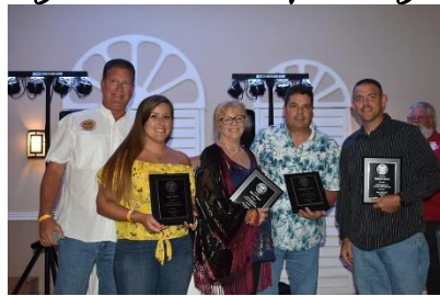
10 year members