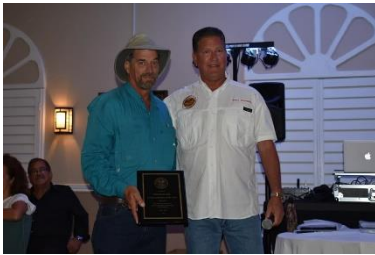
Conservationist of the Year