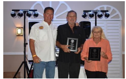
5 year members