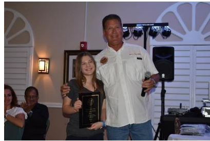
Youth Conservationist of the Year