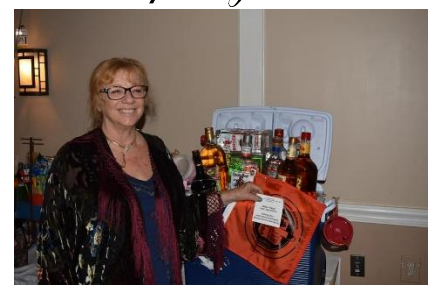
The Basket of Cheer Winner