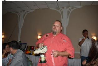
Our 50/50 Raffle Winner a.k.a the luckiest man in the club

View all of the photos on our Facebook Page or click the link below: