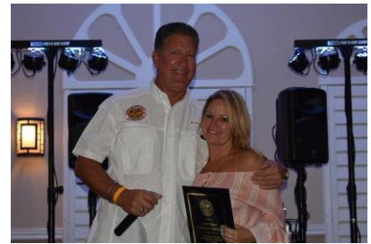
Member of the Year