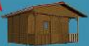
Stop 3 The Chicken Coop 1pm-1:45