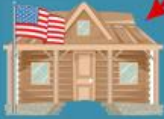
Stop 4 Old Glory Camp 2pm-2:45