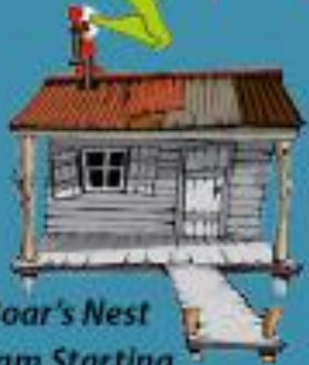
Boar's Nest 10am Starting 3pm Poker Games