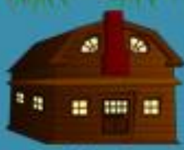
Stop 2 Loxahatchee Hilton 12pm-12:45