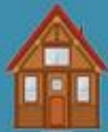
Stop 1 The Naked Lady 11am-11:45