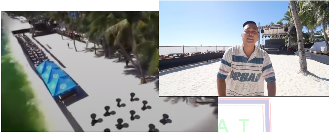
Sample beach party venue

Cleanliness must be maintained even during the parties. Teams are advised to bring their trash along with them when they leave the beach, or dispose the same in the proper disposal bins located outside the beach area. There are no trash bins on the beach itself.