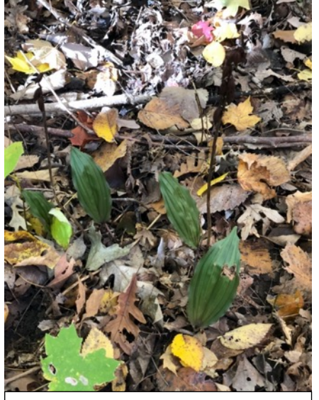
Aplectrum leaves and seed pods - Gladstone, Missouri

To find the flowers in the spring it is almost necessary that you remember where the leaves were located during winter months. Blooming occurs from April through June over its range. Usually less than 10% of the plants producing leaves produce inflorescences. There may be several years that a given plant does not bloom, and some plants go dormant for several years, not even producing leaves. A few of the leaves may still be visible as the flower spike appears. Since the plants may self-pollinate, most blooms produce seed pods. Aplectrum may also be pollinated by sweat bees, Lasioglossum oblongum . The flowers have a deceptive fragrance that lures the bees.