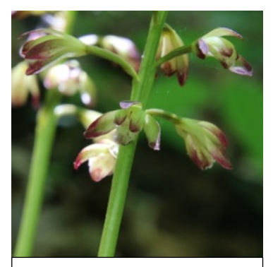
Aplectrum flower – Dayton Metro Parks, Ohio

Aplectrum hyemale is commonly called the Putty Root Orchid or the Adam and Eve Orchid. "Putty root" refers to the sticky material formed by crushing the root tubers and mixing with water. This was used by early settlers in America to repair pottery.