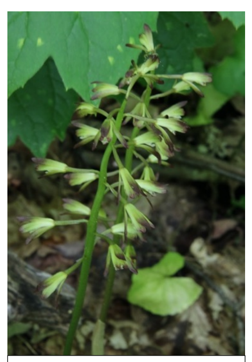
Aplectrum – Dayton Metro Parks, Ohio

To find the flowers in the spring it is almost necessary that you remember where the leaves were located during winter months. Blooming occurs from April through June over its range. Usually less than 10% of the plants producing leaves produce inflorescences. There may be several years that a given plant does not bloom, and some plants go dormant for several years, not even producing leaves. A few of the leaves may still be visible as the flower spike appears. Since the plants may self-pollinate, most blooms produce seed pods. Aplectrum may also be pollinated by sweat bees, Lasioglossum oblongum . The flowers have a deceptive fragrance that lures the bees.