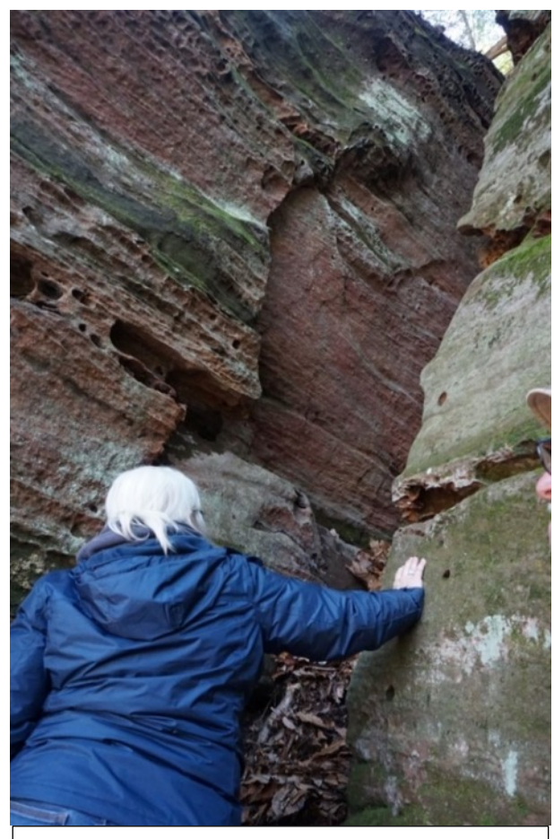
From the bottom, looking up.

Our adventure included a harrowing climb up the "crack", a fissure in rock with fallen leaves on top of slippery mud on the nearly vertical floor. By supporting feet and elbows on the rock sides, we all slowly but successfully inched up about 30 feet to the top. Note that we ALL made it.