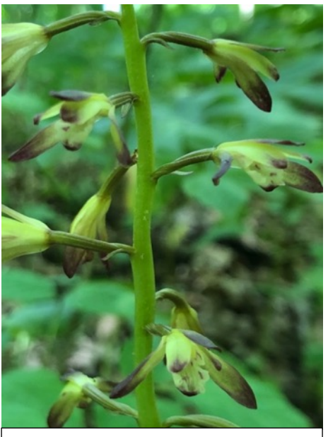
Aplectrum – Dayton Metro Parks, Ohio

Plant glabrous throughout, 30-35 cm tall. Roots slender, attached to a bulbous corm. Leaf solitary, elliptic, plicate, basal, 12-15 cm long x 6-7 cm wide, upper surface light green with white veins, lower surface lightly tinted with purple. Inflorescence a loose raceme, scapose, with 8-15 flowers, each subtended by an inconspicuous floral bract 2-4 mm long. Lip 10-12 mm long x 5-7 mm wide, generally obovate, 3-lobed, white with purple markings. Petals oblanceolate, 6-8 mm long x 2-2.5 mm wide, greenishwhite, tinted with purple, especially at the tips. Sepals 8-10 mm long x 2-3 mm wide, otherwise like petals.<sup>2</sup>