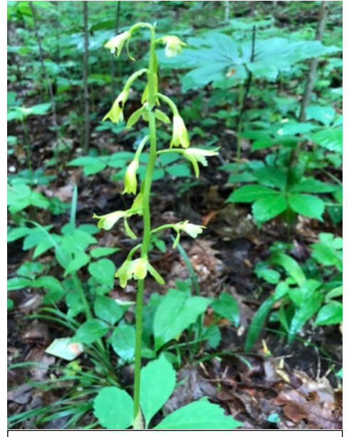
Aplectrum alba variety – Fort Hill, Ohio

The roots of the plants can be 1 to 4 individual 1-inch corms connected by thin rhizomes with a new corm produced each spring. The new corm is larger than the older as the older shrinks supporting the new corm's growth. At the base of each corm are fibrous roots. As the roots spread through the surrounding soil, clonal plants can form a colony of Aplectrum plants. Individual corms usually live for 2 years. This root system benefits with a symbiotic relationship with mycorrhizal fungi. The fungi are also needed as they enter the cells of the embryo and feed the developing plant.