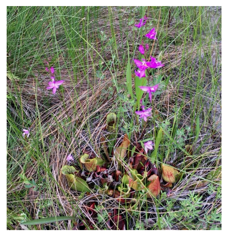
Pogonia ophioglossoides – Rose Pogonia and Calopogon tuberosus - Grass Pink at the Bruce Peninsula

Rose pogonias are often found growing with Calopogon tuberosus - Grass Pink and Arethusa bulbosa - Dragon's Mouth. While you almost always find Rose Pogonias growing with Grass Pinks the reverse is not equally true. Grass Pinks can grow in less acidic conditions.