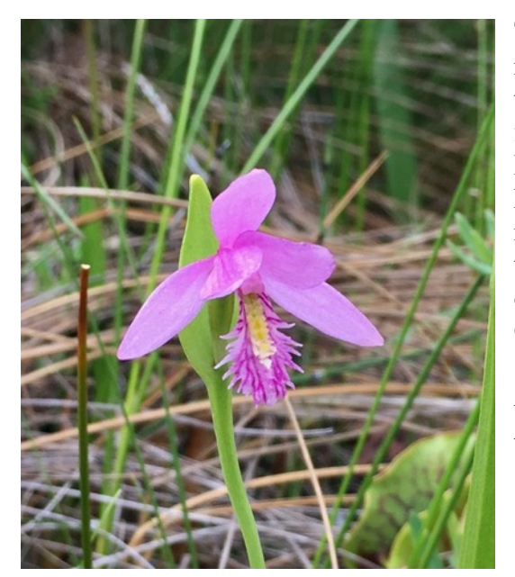
Pogonia ophioglossoides, The Bruce Peninsula, Photo Jan Yates

The plant gets its name, Pogonia , from the Greek word pogon meaning "haired" or "bearded". The beard refers to the bearded lip of the flower. Ophioglossoide refers to the similarity that Adder's tongue ferns ( Ophioglossum ) which have a similar leaf halfway up the stem. Both plants live in similar habitats sometimes sharing the same habitat. Ophioglossoide is derived from the Greek word orphis meaning "snake", glossa meaning "tongue" and eidos meaning "like" that refer to resembling a snake's tongue. The flower has many common names including Rose Crest-lip, Crested-ettercap, Etter-cap, Crest Orchid, Beard Flower, Snake Mouth, Rose-crested Orchid, Snakemouth Orchid, Snake-mouth Orchid, Sweet Crest-orchid, Adder's Mouth, Adder's-mouth Pogonia, Dragon's-mouth and Adder's Tongue Arethusa.