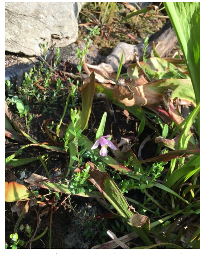
Pogonia ophioglossoides with cranberries and Sarracenia Home Garden Bog, Cincinnati, OH

Pogonia ophioglossoides require that you never let the plants dry out. Also, the medium should to be acidic. They also need a cold period in the winter and are NOT indoor plants. They grow best in outdoor, sunny bog conditions. Garden bog conditions should include non-limestone-based river sand, lumpy peat and living sphagnum. They usually don't bloom the first year after planting or division. They grow in Zones 4 to 9.