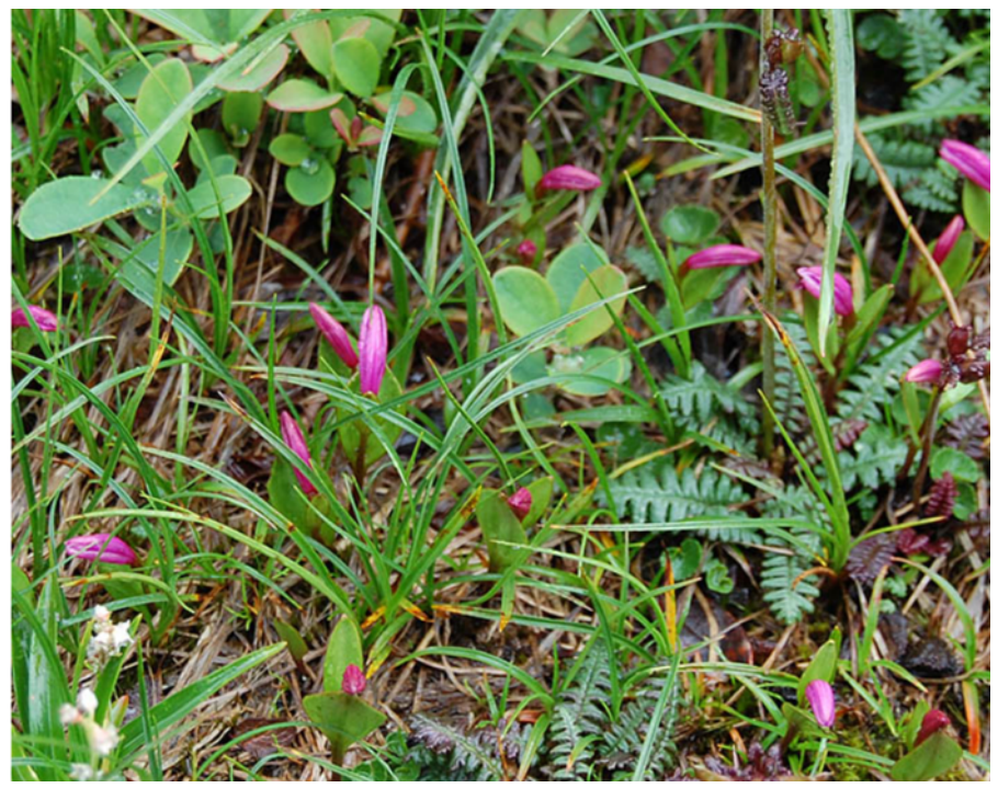
Pogonia yunnanensis 9