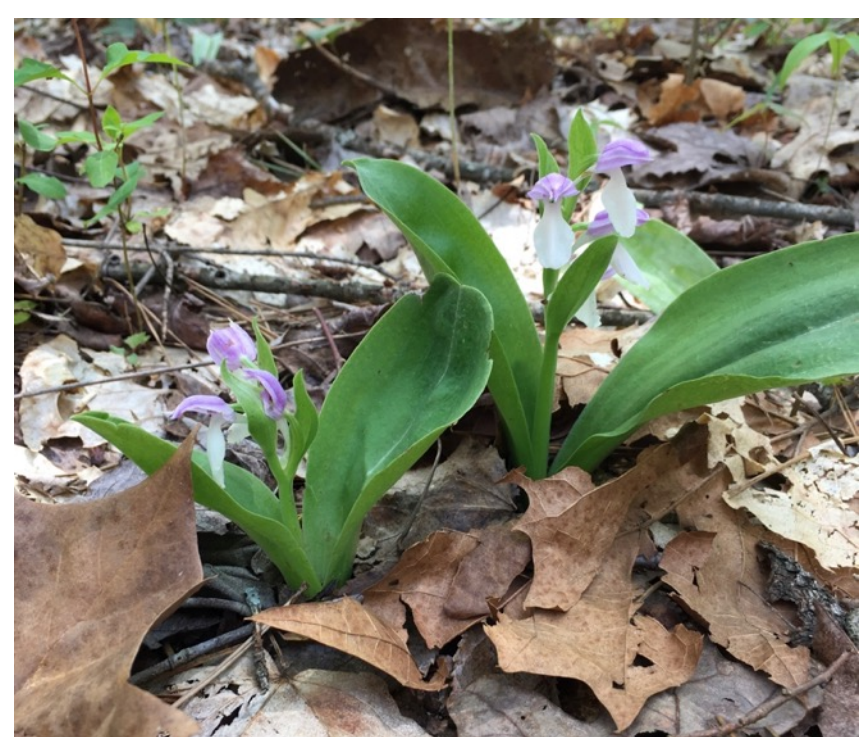
Galearis spectabilis on the trail behind Nature Center

Typically, galearis spectailis blooms before the forest canopy is fully leafed out, in rich, moist soils, near streams or