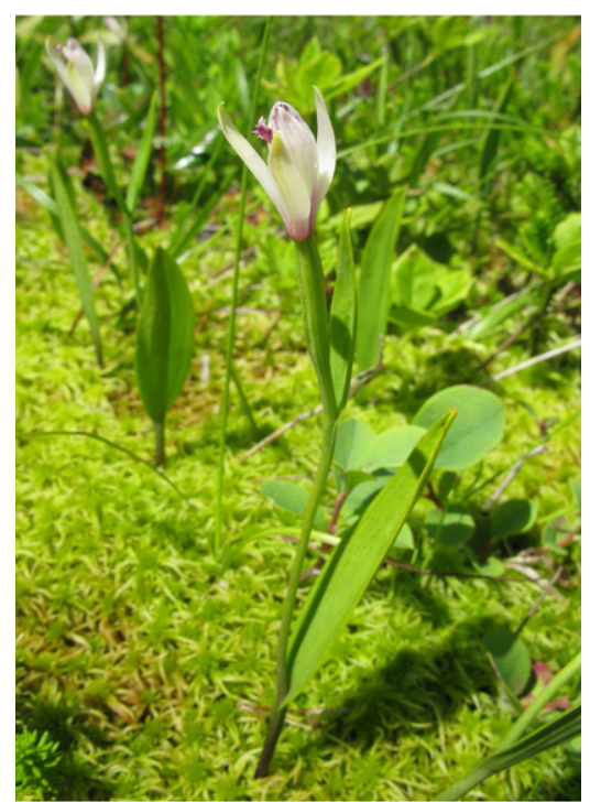
Pogonia minor Nihonmatsu city, Fukushima pref., Japan <sup>8</sup>

Pogonia japonica grows in wetlands at 3,600–7,500 ft in elevation.