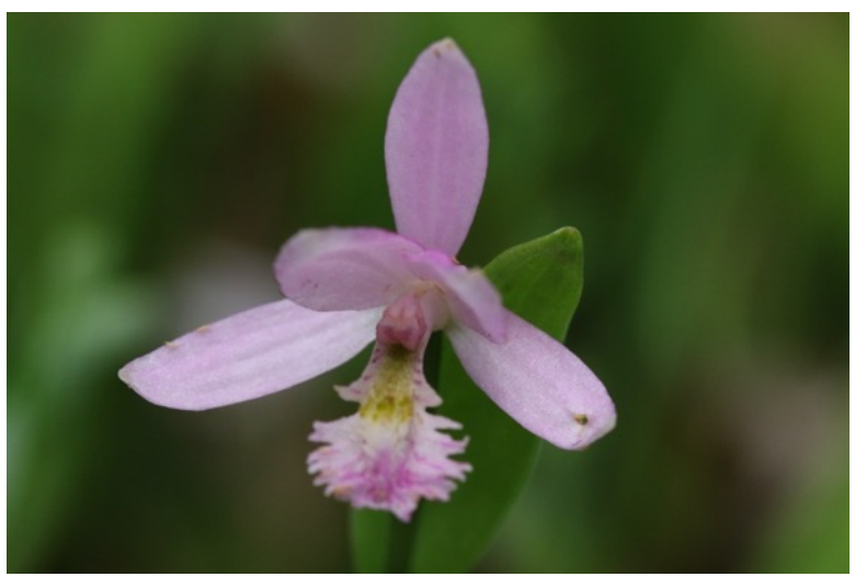
Pogonia ophioglossoides Cranberry Bog, Buckeye Lake, OH

Plant glabrous throughout, 20-25 cm tall. Roots slender, fibrous, with root shoots from which new plants arise. Leaf solitary on the lower half of the stem, ovate to elliptic, 5-6 cm long x 15-18 mm wide. Inflorescence consisting of 1 (rarely 2) flower(s) terminating the stem. The floral bract foliaceous, oblong-elliptic to lanceolate, 3-3.5 cm long 6-8 mm wide. Lip 15-18 mm long x 5-7 mm wide, pink, spatulate, heavily fringed on the margin, with 3 rows of yellow bristles occurring lengthwise through the middle of the lip. Petals pink, elliptic, 16-17 mm long x 5-6 mm wide. Sepals pink, elliptic-lanceolate, 17-19 mm long x 4-5 mm wide. 1