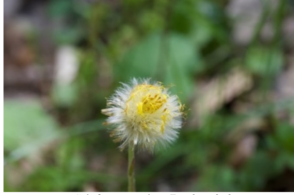
Coltsfoot, past prime, Tussilago farfara

Just to prove that we are still generalists and not completely orchid obsessed, we saw a few other cool things: