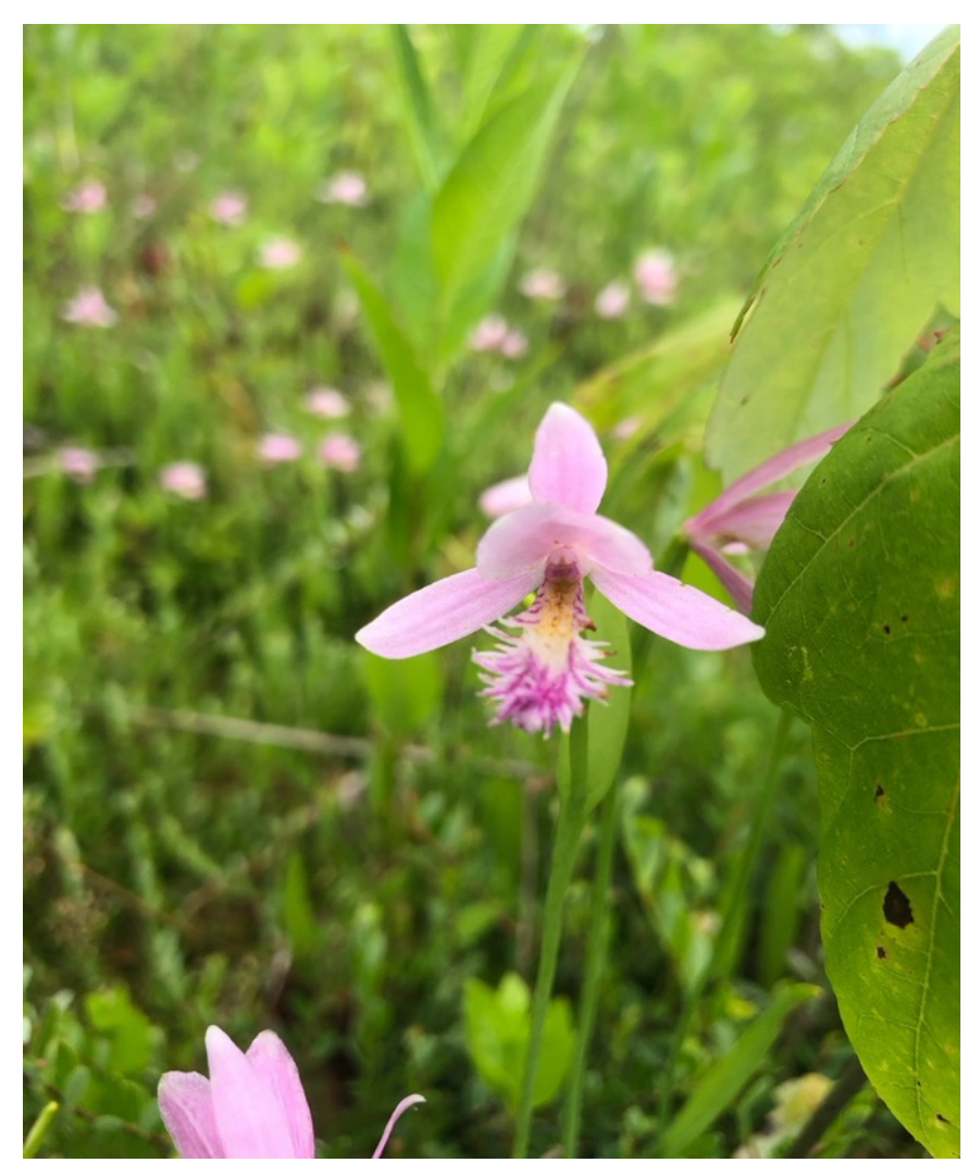
Pogonia ophioglossoides Rose Pogonia, Snake-Mouth Orchid Cranberry Bog, Buckeye Lake, OH

The Rose Pogonia is an erect plant with a single stem which can vary in height from 4 inches to 3 feet. The stem has a single clasping simple leaf halfway up its stem. It has one to three rose pink to white flowers. It grows in sunny bogs and height may vary when surrounding growth shades the plants. In some areas, periodic burns are needed to control the growth of surrounding plants allowing the plants to prosper. When the overgrowth is minimal, the plants spread readily by means of rhizome like roots or stolons covering a wide region. At one time it was the most abundant bog orchid in Eastern United States.