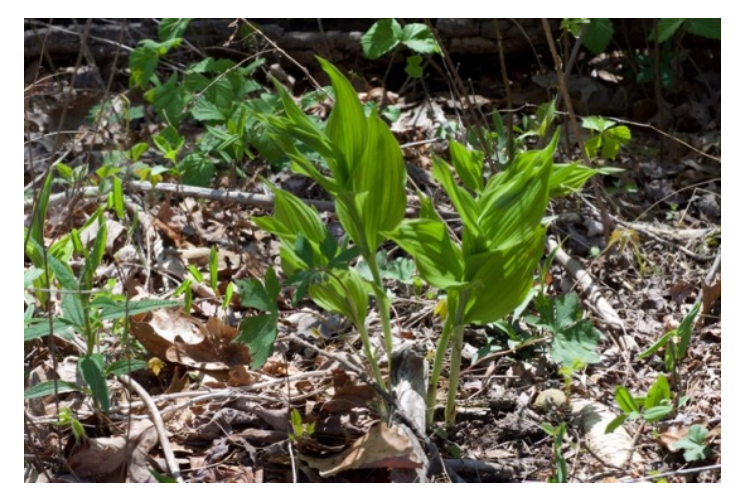
Cypripedium parviflorum var pubescens

Our first stop was the intersection of Roads 3 and 6 for Cypripedium acaule and Cypripedium parviflorum . Typically, from the intersection we mosey further downhill on Road 3 and start looking at the edge of the woods. So, we did that ... and saw very little; only a few yellows thinking about blooming.