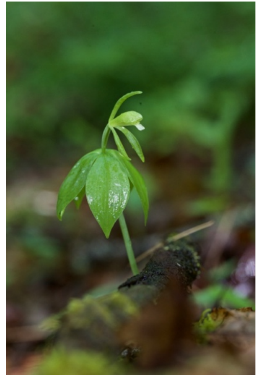
Isotria (Isotria medeoloides Small Whorled Pogonia

In North America, "pogonia" commonly refers to the Tribe Pogonieae which contains genera Isotria (Isotria medeoloides - Small Whorled Pogonia and Isotria verticillata – Large Whorled Pogonia) and Cleistesiopsis (Cleistesiopsis bifaria - Spreading Pogonia, Cleistesiopsis divaricata - Rosebud Orchid, and Cleistesiopsis oricamporum - Small Coastal Plain Spreading Pogonia).