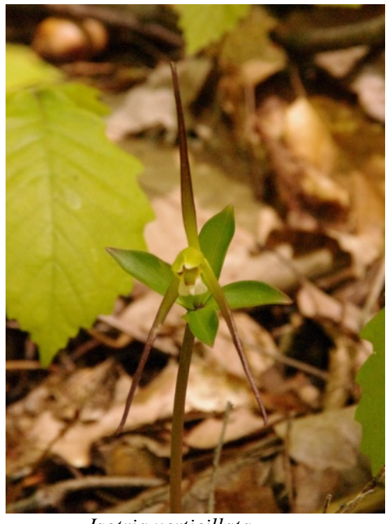
Isotria verticillata Large Whorled Pogonia