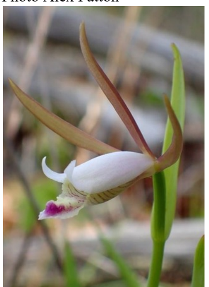
Cleistesiopsis bifaria Spreading Pogonia