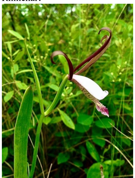
Cleistesiopsis oricamporum Small Coastal Plain Spreading Pogonia

Pogonia ophioglossoides var. brachypogon Fernald is a Canadian synonym while Arethusa ophioglossoides Linnaeus 1753 is the historical synonym. Pogonia ophioglossoides (Linnaeus) Ker Gawler 1913 is the accepted name.