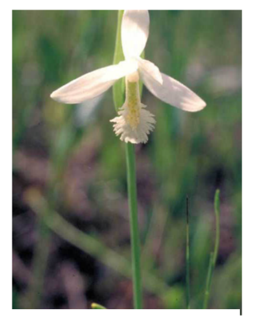
Pogonia ophioglossoides var albiflora <sup>3</sup>

Rose pogonia uses deception for pollination. Its fragrance attracts bumblebees but supplies little reward. It is pollinated mainly by bumblebees Bombus borealis, Bombus fervidus, Bombus sandersoni, Bombus ternarius. Bombus terricola and Bombus vagans. Mostly juvenile bumblebees are the pollinators as they appear to learn from the lack of rewards.