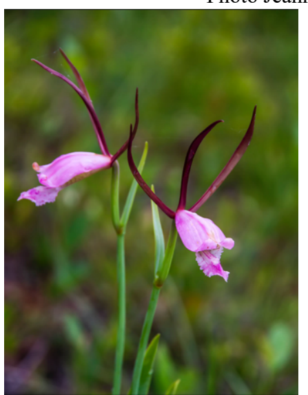
Cleistesiopsis divaricata Rosebud Orchid Photo NC Orchid <sup>10</sup>