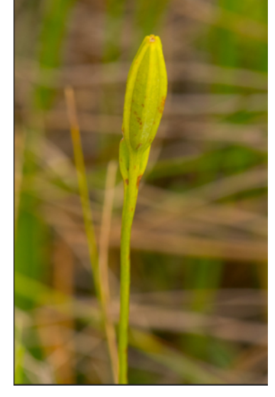
Rose Pogonia Seed Pod Comstock Bog Meadow, WI Photo Joshua Mayer <sup>11</sup>

After pollination occurs, the seed pod forms. The pod is erect and up to 1 in long. When it dries, the pod cracks open and the dust like seeds travel through the air with many landing in the surrounding wetlands. The seeds take root and form new seedlings. Pogonia ophioglossoides also grows vegetatively.