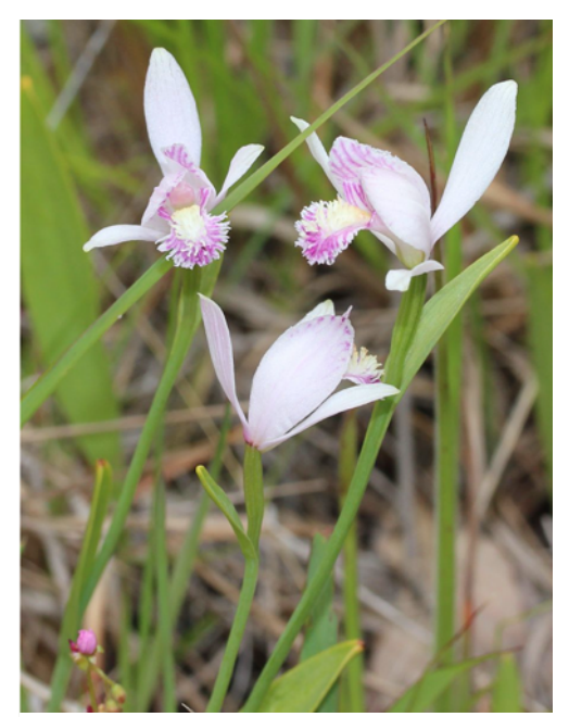
Pogonia japonica , Asian Pogonia, Aichi pref., Japan <sup>6</sup>

Historically most of the Pogonia species listed were only Pogonia ophioglossoidess and Pogonia japonica . Both species occurred over a large portion of North America and Asia respectively. Many writers marveled that such similar species should occur in such far apart regions of the globe.