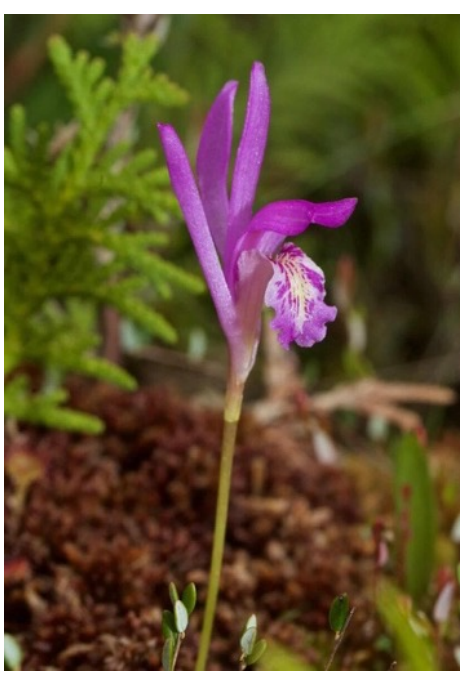
Arethusa bulbosa Dragon's Mouth

Hunting for native orchids as you hike the various preserves and wild areas can be a rewarding pastime. As you