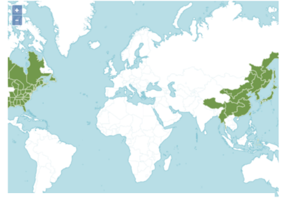
From KEW 4

The genus Pogonia (Jussieu) has species occurring in North America ( Pogonia ophioglossoides ) and Asia ( Pogonia japonica ). Pogonia japonica occurs in China, Japan and the Korean Peninsula. There are now 3 more recognized species: Pogonia minor in Taiwan and Japan on Hokkaido, Honshu, Kyushu, and Shikoku; Pogonia trinervia in the Molucca Islands; and Pogonia yunnanensis in the Yunnan province in China.