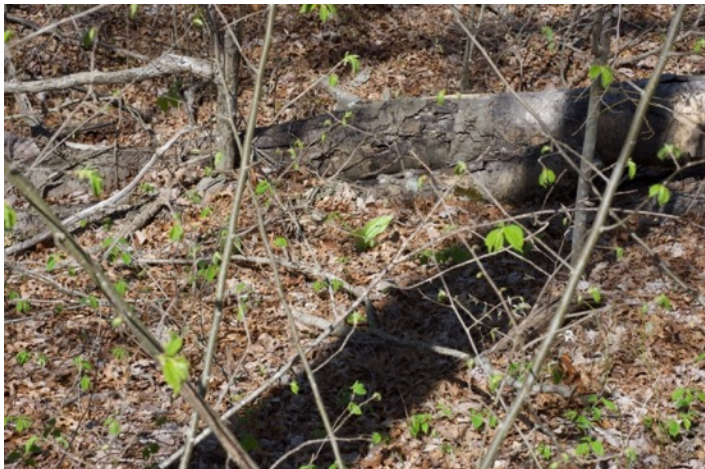
Woods below Forest Road 3 with Cypripedium acaule

Then we trekked down the slope into the woods below Road 3 at the intersection, where the hardest part of the 'hike' is detangling one's clothes from the scratchy things (aka wild roses) that clutch at us. This patch of woods