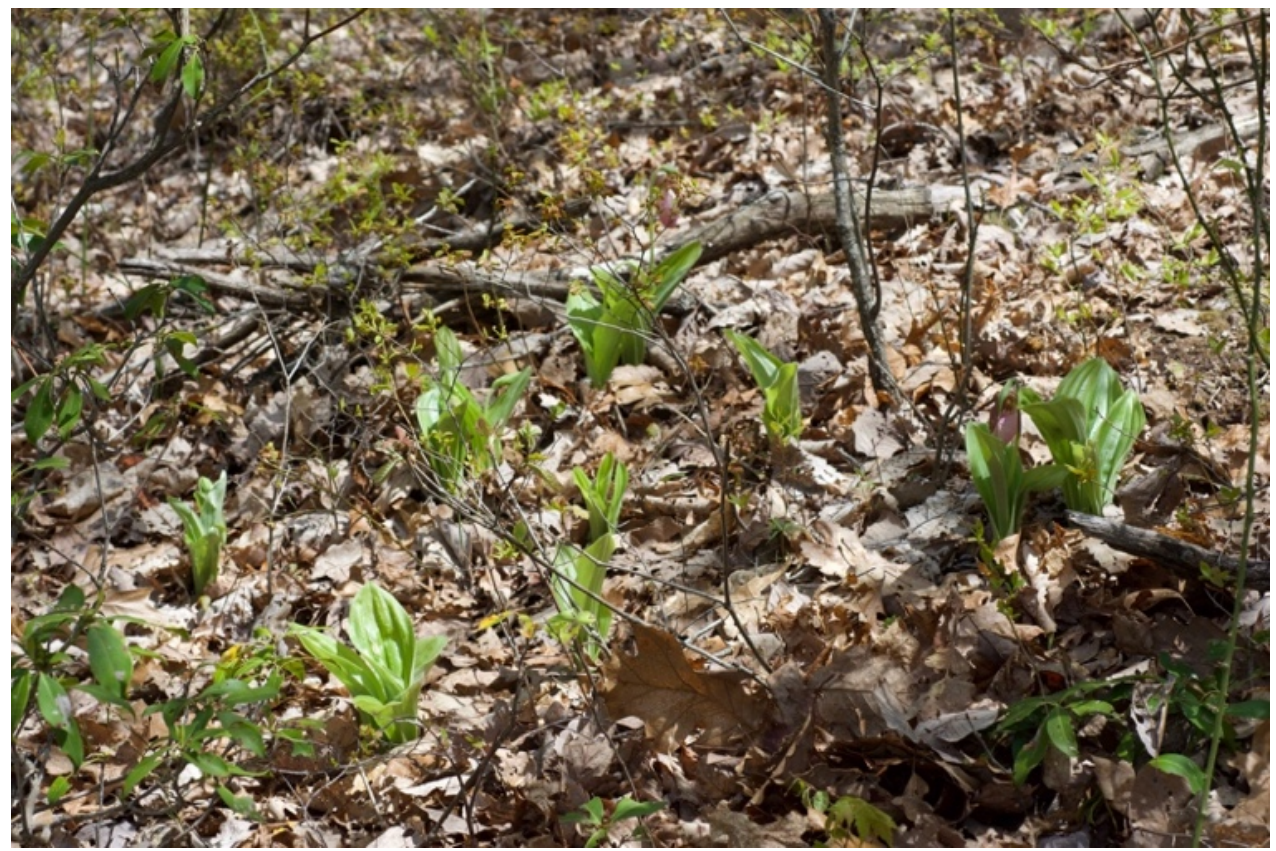
Cypripedium acaule on hillside at Roads 1 and 2