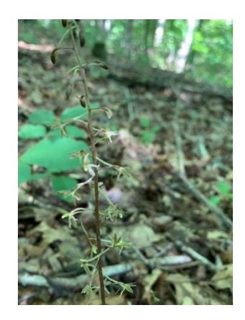
Tipularia discolor, Cranefly orchid