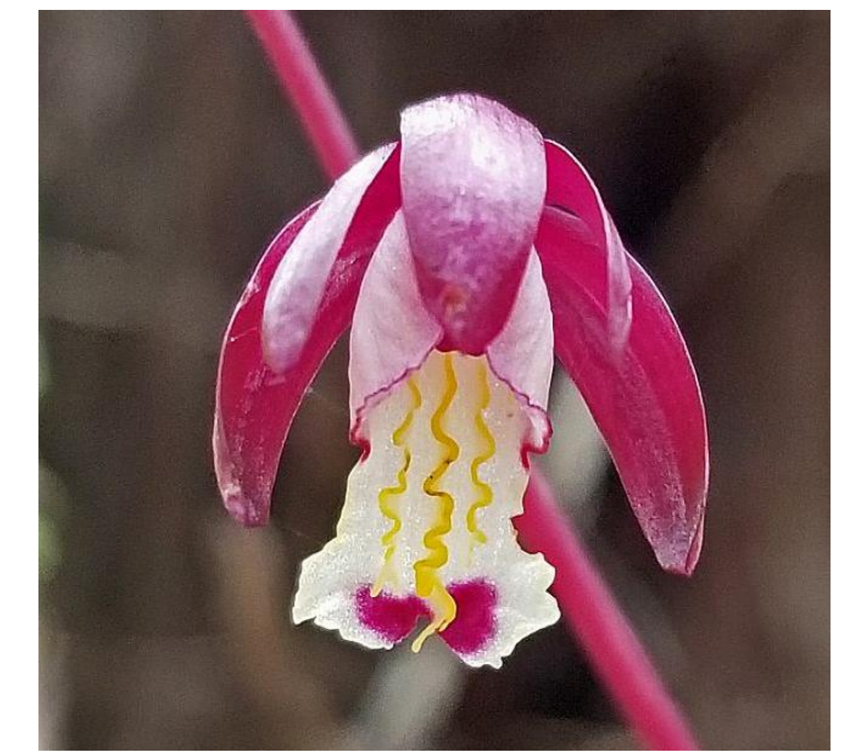
Texas Purple Spike, showing the contrasting colors and the vivid yellow "stripes" on the lip, which can go from three (left) to one (right).

While the two Hexalectris orchids tended to be short in stature, the same was not true for the Arizona Crested Coral Root ( Hexalectris arizonica ). The spikes were quite thick in diameter and very robust. Most of the spikes had flowers that were somewhat closed - they tended to be self-pollinating as well, but every now and then, there would be an open flower, and they resemble the Crested Coral Root ( Hexalectris spicata ).