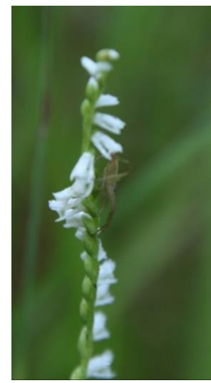
Slender Ladies' Tresses, Spiranthes lacera