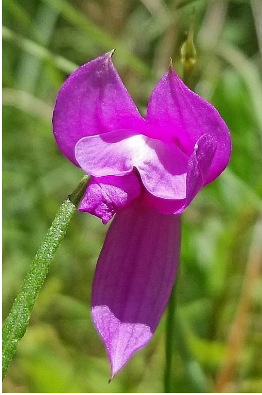
Grass Pink Orchid opening up.

I was warned that the Grass Pink Orchids ( Calopogon tuberosus ) would be done blooming by then. However, a short walk around the fen revealed a vivid purple bloom unfurling - a Grass Pink Orchid that did not receive the