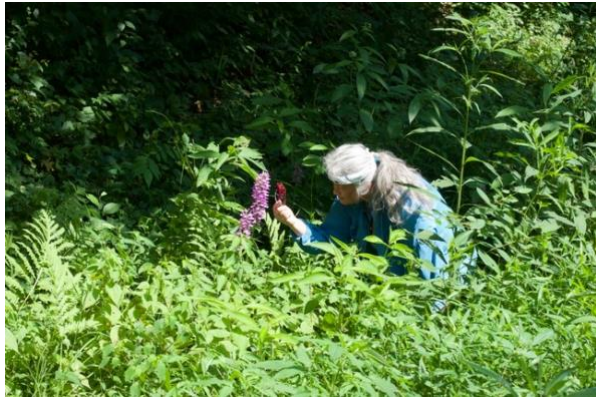
Angela Carter photographing Platanthera peramoena

As a group, we created our own trail through the high grass to see the Platantheras closest to the park entrance then we split into smaller groups and just explored, walking further and further along the highway, away from our cars, stopping to take pictures. And avoiding traffic while we did it – it was a busy road.