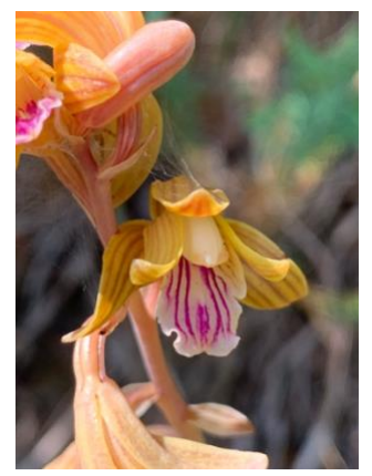
Hexalectris spicata, Crested Coralroot orchid