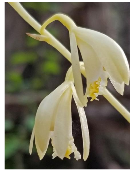
Alba form of the Texas Purple Spike ( Hexalectris warnockii ).

we could see all three types of blooming Hexalectris orchids (Unfortunately, H. grandiflora had not bloomed for a few years in the Preserve, when they rerouted the trail to better protect the orchid, but in so doing, the habitat