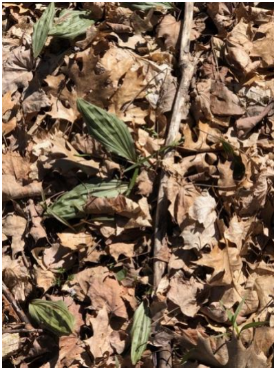
March 23, 2019

We are continuing our study of Aplectrum hyemale or Putty Root at Winton Woods. Of the 14 plants that were in bloom, all produced seed pods. So, from 120+ plants visible in March, 14 produced blooms and all 14 produced seed pods.