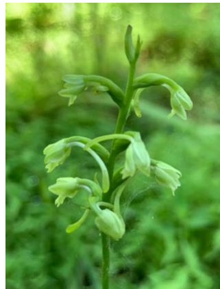
Platanthera clavellata, Club-spur orchid