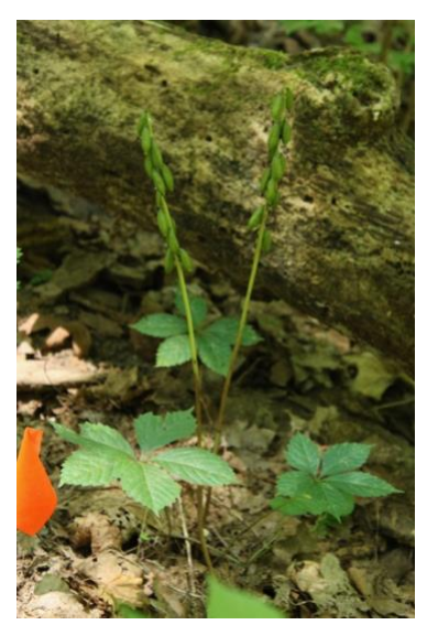
August 4, 2019