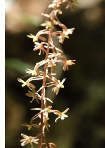
Cranefly Orchids, Tipularia discolor