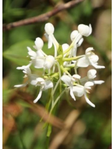
Monkey-faced Orchid, Platanthera integrilabia