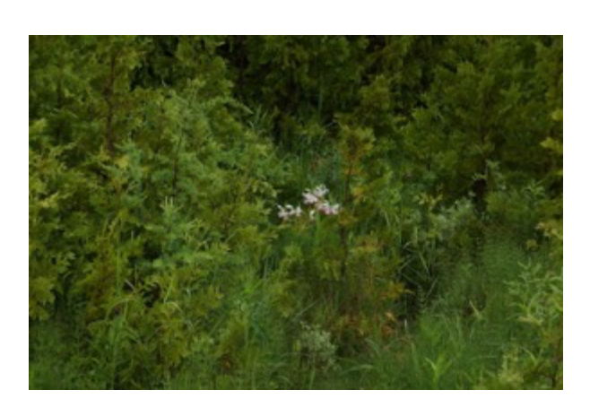
Cypripedium reginaes seen from the boardwalk at Petrel Point Fen, Bruce Peninsula; they looked undisturbed.

Petrel Point Fen, in the Bruce, a few years ago. Here they are: