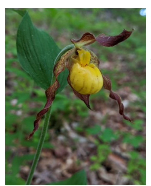
Cypripedium parviflorum var. parviflorum, Kentucky

"Bracts: abaxial surface of distalmost sheathing bract (and often the next) densely and conspicuously silvery-pubescent when young (later sometimes glabrescent). Leaves 4–5, rather evenly spaced along stem, alternate, spreading; blade orbiculate to lance-elliptic to ovate or obovate, 9-19 \times 2.5-9 cm. Flowers 1–2, small, scent moderate to faint, rose or musty; sepals and petals usually minutely but densely spotted with reddish brown or madder and appearing uniformly dark, rarely only coarsely spotted and blotched; lip oblance-ovoid to calceolate (slipper-shaped), 22–34 mm; orifice 12–19 mm."