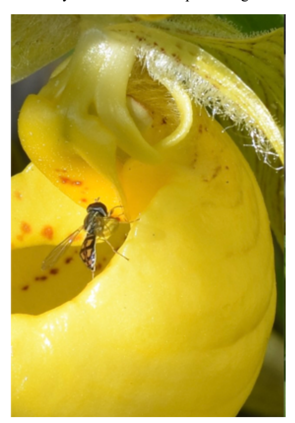
Cypripedium parviflorum var. pubescens showing one of the syrphid flies of the family Syrphidae. Also note pubescent hairs.

While Cypripedium parviflorum is the best known and widest spread of North American native orchids, it or one of its varieties is threatened or endangered over much of its range. The various state