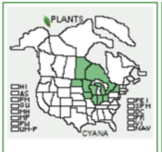
Cypripedium ×andrewsii var. ×andrewsii [candidum × parviflorum var. makasin] hybrid ladyslipper