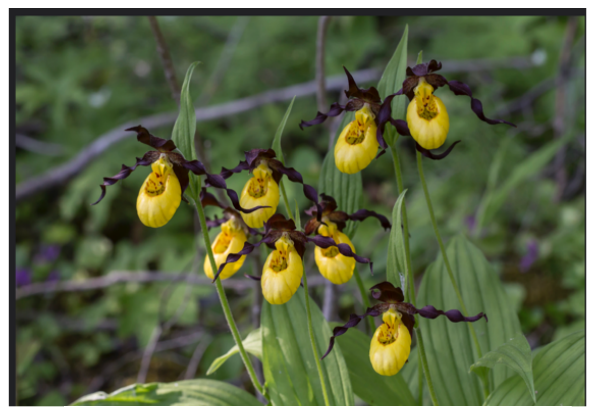
Cypripedium parviflorum var. makasin , Manitoba.