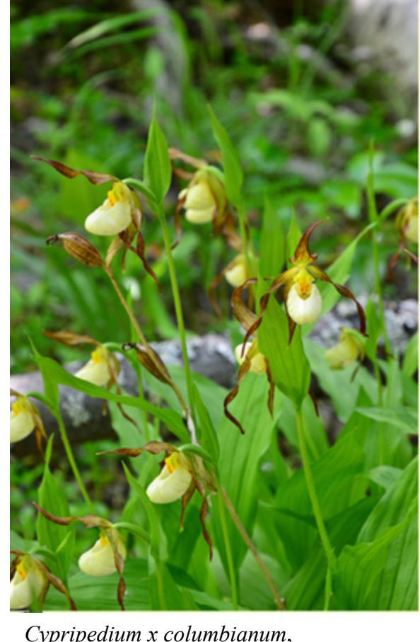
Cypripedium x columbianum, Washington.