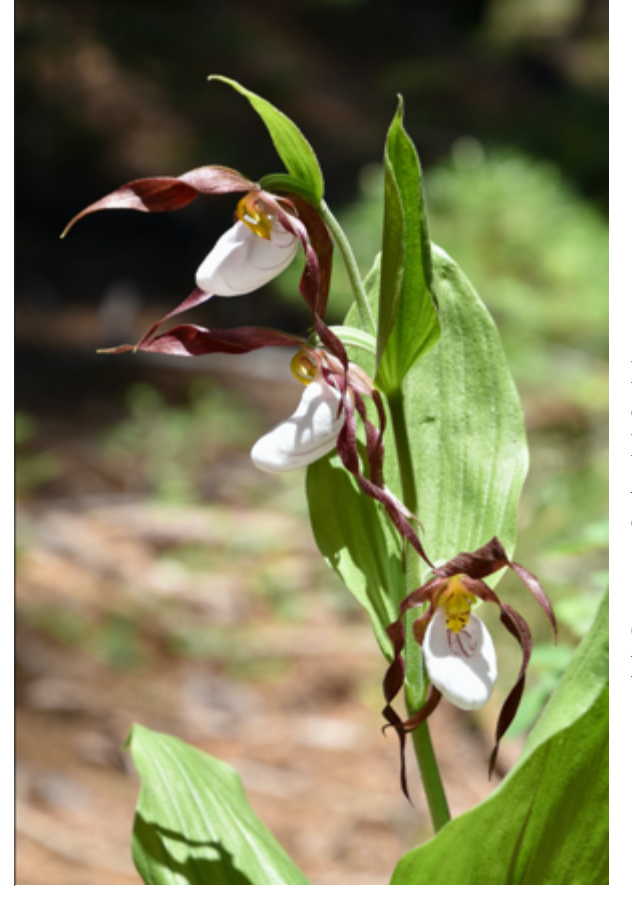
Cypripedium montanum, California

Most of our group have not been able to see one of the parents of this hybrid Cypripedium montanum Dougl., ex Lindl., the Mountain Lady's Slipper, as it is found in western North America from California to southern Alaska at the edges of deciduous forests.