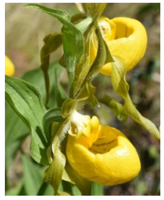
Cypripedium parviflorum var. pubescens showing hairs on petals and bracts.

"An old Ojibwe legend tells of a village visited by plague. It was the dead of winter and many died, including the village healer. To save the community, a young girl made a dangerous journey through the snow to find medicine for the sick. She succeeded, but on the way lost her moccasins, leaving a trail of bloody footprints in the snow. When spring arrived, the bloody footprints put forth moccasin flowers, better known today by their Western name, the lady's slippers." 1