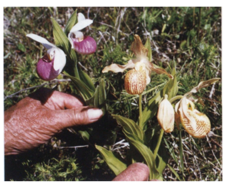
Cypripedium x herae and Cypripedium reginae, Manitoba.