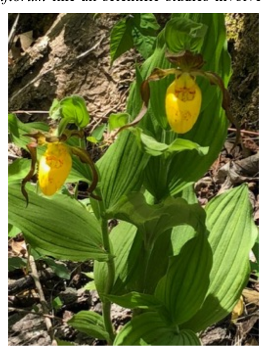
Cypripedium parviflorum var. pubescens, Ohio

Recognized throughout the world for over three hundred years as an extremely variable plant, the yellow lady's slipper has had various names over the same time period. When the exact name of a plant cannot be determined, discussion about the plant is difficult. Thus, an agreed upon name is vital. Because of the variation in Cypripedium parviflorum , people naming the plant have given it different names. The following is a short summary of how this has contributed to the naming and variation issues. I am not going to list all the names of