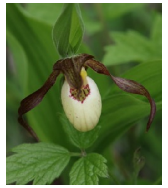
Cypipedium x andrewsii Castalia, Ohio

Cypripedium candidum forms three hybrids one with each of the Cypripedium parviflorum varieties. Different parents crossing with Cypripedium candidum produce variations in color in the hybrids. Crossed with Cypripedium parviflorum var. makasin the hybrid had maroon to dark purple brown sepals and lateral petals and its lip is dull white or ivory. When crossed with Cypripedium parviflorum var. pubescens the sepals and petals are greenish yellow streaked with brown and the lip cream fading to dull yellow. Below the ranges are given for the different hybrids and their variety names. When both parents are not found in the same area as the hybrid, it is difficult to determine which of these varieties may be present. I was not able to find any photos defining these three varieties.