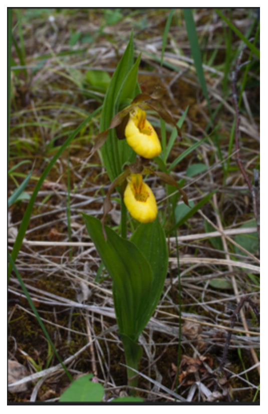
Cypripedium parviflorum var. pubescens, Alberta.

The photograph at right 12 is of Cypripedium x herae and Cypripedium reginae found in a field in Manitoba. Cypripedium x herae is a hybrid of Cypripedium parviflorum var. pubescens and