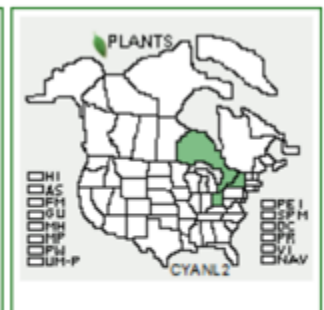
Cypripedium ×andrewsii var. landonii [× andrewsii var. favillianum × parviflorum var. parviflorum ] hybrid ladyslipper

The following pictures are at sites in Michigan and Ohio. The Ohio site is a sunny meadow and so far, we have only found Cypripedium candidum . along with the hybrid. Most references for the site refer to the cross being with Cypripedium makasin , but we have not to be able to find the other parent.