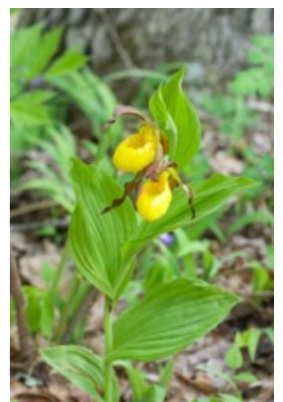
Cypripedium parviflorum var. pubescens, Ohio

https://www.flickr.com/photos/ab_orchid/albums/72157647414476446 ----- https://www.flickr.com/photos/ab_orchid/albums/72157718189598138