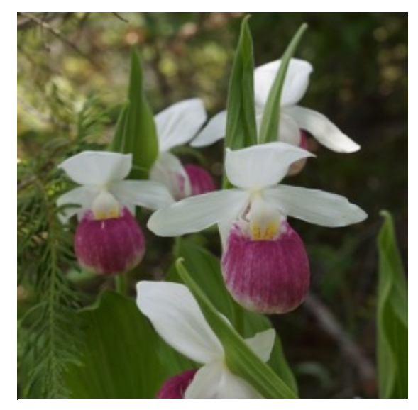
Cypripedium reginae, Bruce Peninsula

Cypripedium reginae. This hybrid is a rare find as the two parents' bloom times rarely overlap making pollination difficult. The name Herae comes from the name of the Greek queen of the gods, Hera who walked in golden slippers. It was chosen because the cross was with the queen of the orchids Cypripedium reginae and has golden coloration.