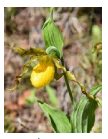
C. parviflorum var. pubescens, Bruce Peninsula