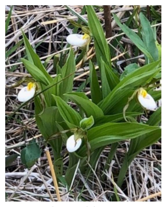
Cypripedium candidum Castalia, Ohio