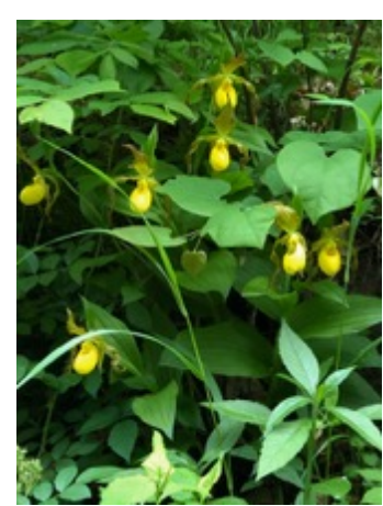
C. parviflorum var. pubescens, Ohio and not always found in a sunny environment.