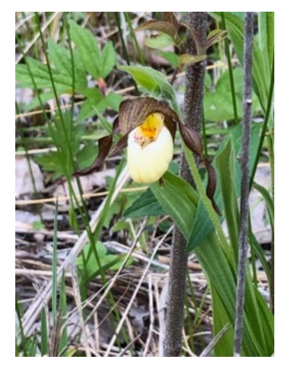
Cypipedium x andrewsii Castalia, Ohio

The second site is in Michigan and again this time we only found one parent, Cypripedium parviflorum var. makasin . This site is much more shady and almost swampy. The plants are mostly found on raised sunny hummocks in the surrounding swamp.