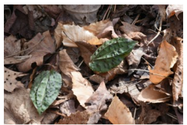
Tipularia discolor Cranefly Orchid

On the next hill, last year we found a fallen log and three to four seed pods of the crane fly orchid, with the leaves still hanging on. That appeared to be 'it' for this hillside but finding those leaves was worth doing again. And what we found was remarkable; first, the plants from last year's find seemed to be quite happy – I thought at least one leaf was markedly larger. And at all the other fallen logs and log remnants, we found more clusters of leaves. As we walked slowly uphill, taking pictures all the while, we ended at a tree, whose base was almost entirely