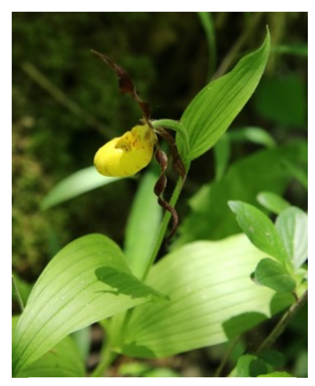
Cypripedium parviflorum var. makasin, Waterloo, Michigan

The second site is in Michigan and again this time we only found one parent, Cypripedium parviflorum var. makasin . This site is much more shady and almost swampy. The plants are mostly found on raised sunny hummocks in the surrounding swamp.