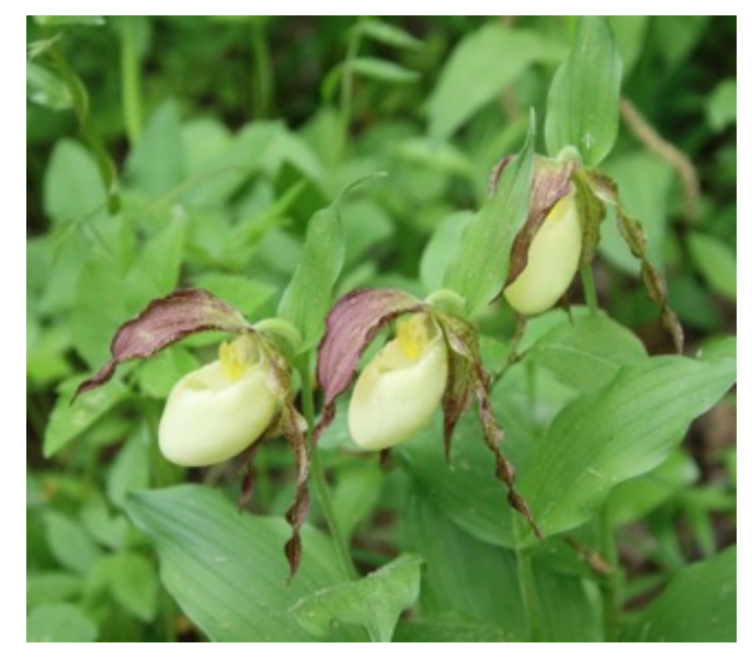
Cypripedium kentuckiense from Kentucky

arguments for a single species were: 1) the variation