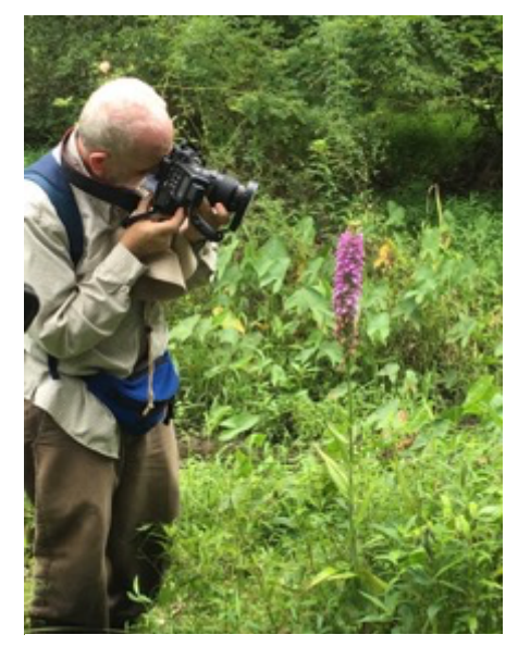
Platanthera peramoena in a Maryland park

Orchids bloom in generally good weather unless the forecast is wrong, and a thunderstorm coincides with arrival at your destination. How do you protect your camera/phone/lens in the rain, not drop it in the creek and not leave it behind in the prairie grass when you depart?