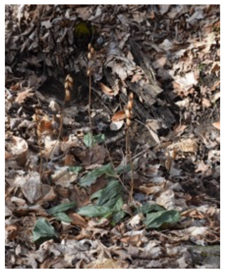
Aplectrum hyemale Puttyroot

and Silver trails. Many of us know the prime location, at the 'dip' in the trail where, when the flowers bloom, the leaf canopy is so oppressive, I refer to it as 'taking pictures in the bat cave" and nonorchid hikers pass us on the trail and cannot figure out what we are doing. That location seemed to be in very good shape. What was nicer is that, in the sun, we found additional single plants and pairs which will be worth finding again during bloom time. These were off the trail by 10-20 feet on the hillside, near the trail and a handful