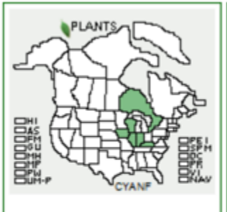
Cypripedium ×andrewsii var. favillianum [candidum × parviflorum var. pubescens] hybrid ladyslipper