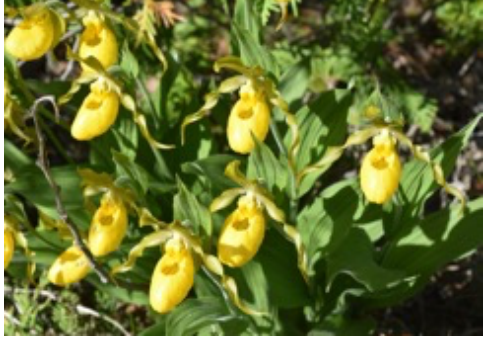
Toni Doty shooting, from the side of the road, some of the thousands of Cypripedium parviflorum var. pubescens , the Large Yellow Lady's-Slipper, in the Bruce Peninsula.

This is not an article about technique, but I asked my friends for advice anyway and they said: READ THE MANUAL and PRACTICE, PRACTICE, PRACTICE. Specifically, practice around home or in parks the kind of photography you will be doing in the field. Think about what orchids you are planning to shoot, how you plan to use your pictures and pack your bag accordingly. If uncertain about depth of field, shoot the orchid from farther away; you can crop the picture later. Shoot from various angles and include shots of the entire plant, not just flowers. If you plan to use a tripod, practice before your hike setting it up and breaking it down.