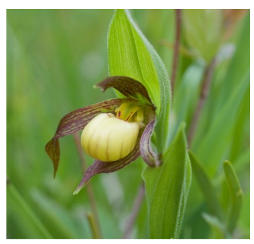
Cypripedium x andrewsii , Castalia, Ohio

The Cypripedium parviflorum complex has five natural hybrids. Three are hybrids of Cypripedium parviflorum varieties with Cypripedium candidum . The other two natural hybrids are crossed with Cypripedium montanum and Cypripedium reginae .