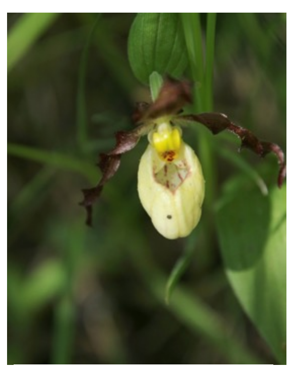
Cypripedium andrewsii Waterloo, Michigan