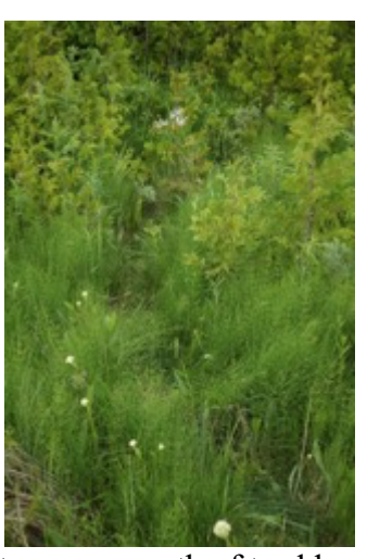
Three days later, a new path of trodden plants led to the Cyps

When my friends and I were there, you could see the Cypripedium reginaes from the boardwalk and from there, we took our pictures. Three days later, a trail of flattened fen plants led to the Cypripediums even though, as Bruce cyps go, they weren't remarkable. Maybe, even probably, the flattened areas are fine, but I'll close with this instead. Take only pictures, leave only footprints and if in doubt, leave with only memories.