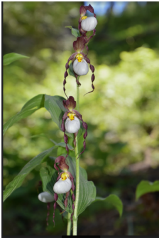
Cypripedium montanum, California