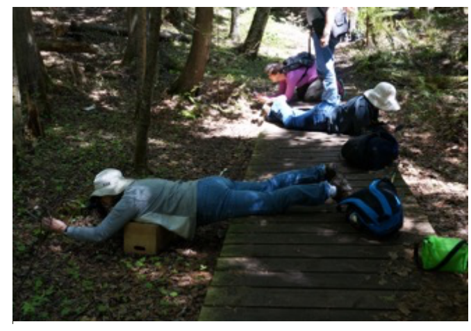
At Flower Pot Island, Bruce Peninsula, small orchids aplenty.

Eric reminded me of the old adage to leave only footprints and that's how I was originally going to close this story – I've certainly used it often enough to close PowerPoint programs. Then he added that he also remembers the plant he is photographing is part of an ecosystem and may rely heavily on a companion plant, soil conditions, and/or shade for continued survival. And I recalled two pictures I took three days apart in