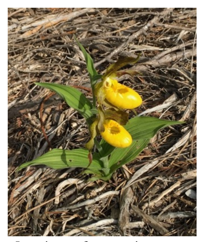
Cypripedium parviflorum var. pubescens Bruce Península, Ontario

"Bracts: abaxial surface of distalmost sheathing bract (and often the next) densely and conspicuously silvery-pubescent when young (later sometimes glabrescent). Leaves 3–5, on proximal portion of or more evenly spaced along stem, alternate, erect to spreading; blade orbiculate or broadly ovate to elliptic-lanceolate or oblanceolate, 7.9-20.9 \times 1.5-12 cm. Flowers 1–2, large to rather small (very small in some boreal and northern cordilleran specimens), scent moderate to faint, rose or musty; sepals commonly spotted, striped, and reticulately marked with reddish brown or madder, rarely extensively blotched or wholly unmarked; lip oblance-ovoid to calceolate or subglobose, 20–54 mm; orifice 10-23(-27) mm. 2n=20"