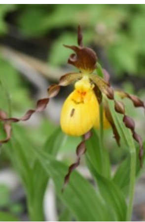
C. parviflorum var. pubescens, Bruce Peninsula