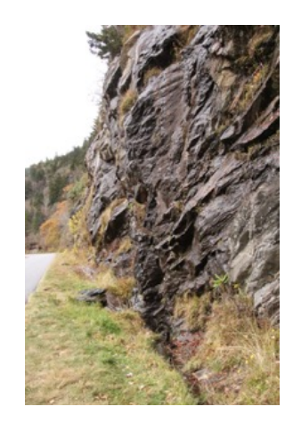
At one of the seeps along the road we found an aging Spiranthes cernua,