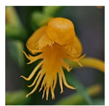
Close-up of a Crested Fringed Orchid flower.

Bob brought us to another location, and went ahead of us to scout – unfortunately, there was only one plant of the Yellow Fringeless Orchid ( Platanthera integra ), and it was still in spike. This is a rare plant for New Jersey, as it is a disjunct population here, whereas the other populations are in the southeastern US and the Gulf Coast. It was a shame not being able to see this plant in bloom.