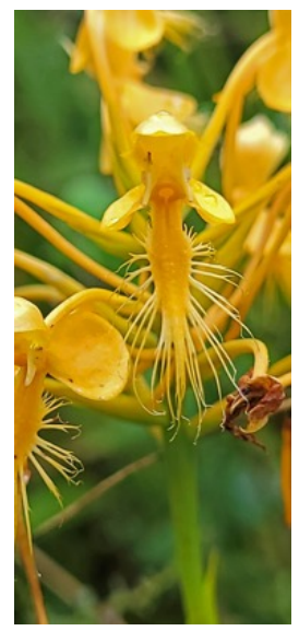
Yellow Fringed