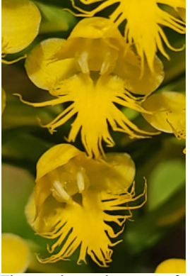
The opening to the ovary of P. x channellii that we saw had a keyhole shape seen in P. ciliaris , rather than the triangular shape that occurs in P. cristata (above).

It is harder to identify the hybrid it makes with the Crested Bog Orchid, Platanthera cristata. One way to distinguish the hybrids, called Platanthera x channellii, is that the flowers are sized more like the small P. cristata flowers, but they have the bold orange color of P. ciliaris, rather than the more yellowish hue of P. cristata: