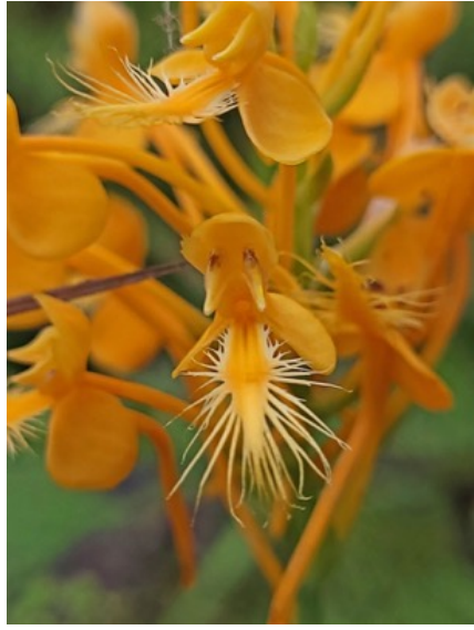
Platanthera x channelii