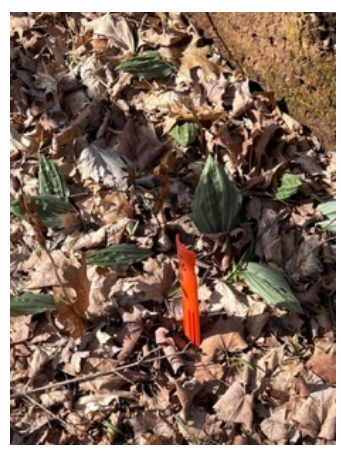
This compares to 2021 figures: 21 locations and 119

Jan Yates and I checked the area in Winton Woods where we have been tracking the number of plants for the last several years. This year looks to be the best year yet with 26 locations containing 144 leaves and 14 seed pods.