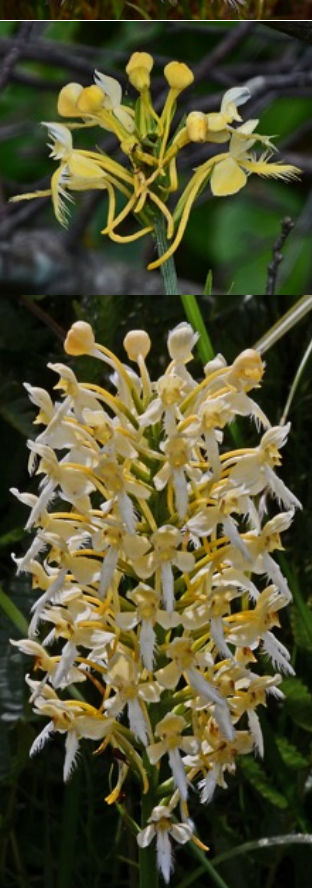
The hybrid, Platanthera x bicolor (the "x" indicates it is a natural hybrid), comes in different shades – from white, off-white, butter cream, butterscotch, to orange (see above ).