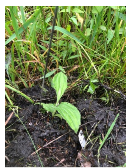
Ohio Alliance (AOA), which has over 15,000 acres of land in various forms of conservation. This site has one existing wild Cypripedium parviflorum var. pubescens plant.

In the spring of 2021, one of these plants bloomed and set a seed pod. In the spring of 2022, a different seedling bloomed, but did not set seed.