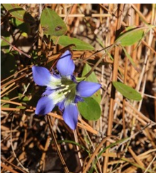
pine barren gentian. We also spent a lot of time trying to photograph woodpeckers. They were very skittish about being photographed. We were able to

We returned to another pine forest in the Carolina Sandhills National Wildlife Refuge, to find Gentiana autumnalis , the