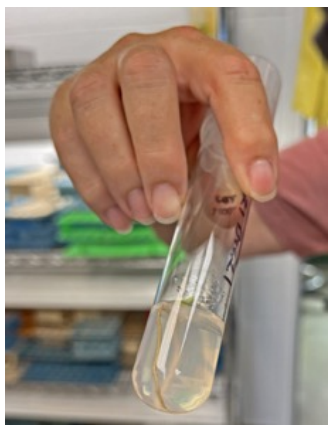
Orchid germinating in a test tube ( above ), and their germination area ( below ).

Given the tight space in the lab, we were asked to split into two groups, with each group being brought to the lab, to show where the orchid seeds were being germinated and flasked, and later shown the greenhouses where orchid seedlings (native and tropical) were grown, and a small plot of outdoor land where some of the native orchids, such as Platantheras, were being grown.