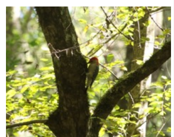
We also heard many woodpeckers in the National Park.