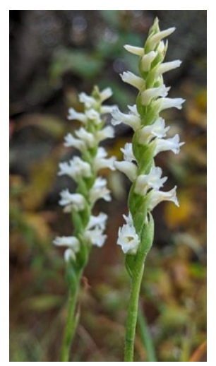
Yellow Lady's Tresses (Spiranthes ochroleuca)