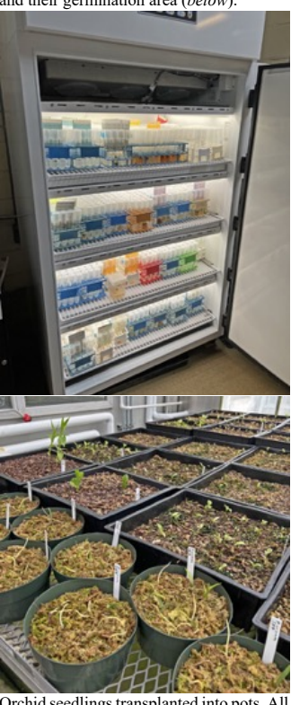
Orchid seedlings transplanted into pots.

While one group was in the guided tour, the other group was wandering around the indoor space nearby and their awarded restrooms, which blended in with the