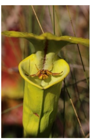
Our next destination was the Green Swamp Preserve in North Carolina to see carnivorous plants including over 15 species and hybris pitcher plants including Sarracenia flava) with an opportunistic Goldenrod Crab Spider (Misumena vatia