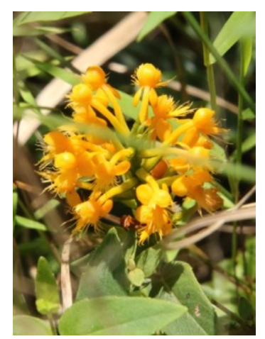
Platanthera cristata