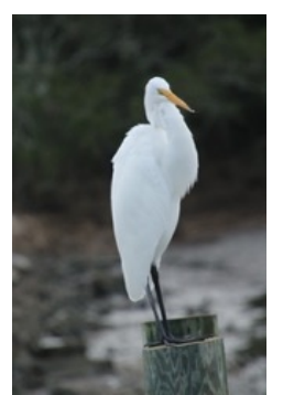
and the Great Egret (Ardea alba),

We returned to another pine forest in the Carolina Sandhills National Wildlife Refuge, to find Gentiana autumnalis , the