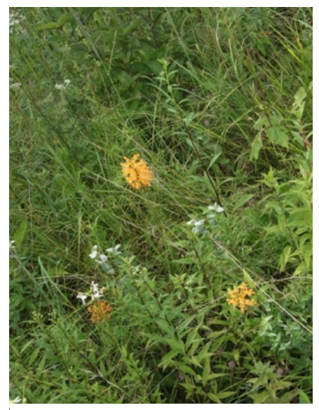
A part of an area with the 3 species and a probable hybrid

non-disclosure preserves to see Platanthera ciliaris, Platanthera cristata, Platanthera integrilabia and some of their hybrids. The area contained plants we could identify as the 3 species but there were many apparent hybrids. Further studies will need to be made to determine which are the parents of the various hybrids. In addition, we did find a total of 8 different species.