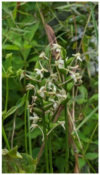
Platanthera clavellata