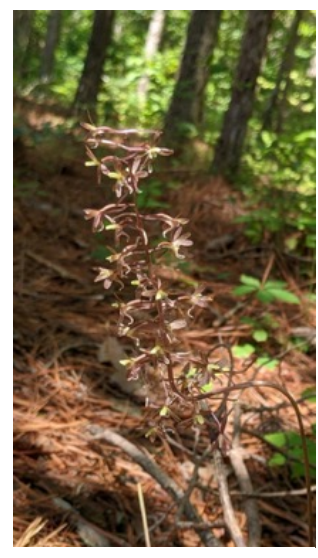
Tipularia discolor