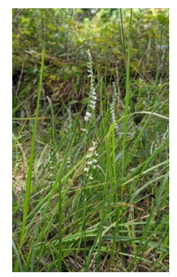
Spiranthes lacera