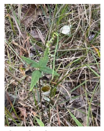
Spiranthes tuberosa