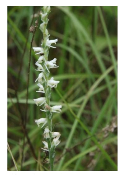
Spiranthes vernalis