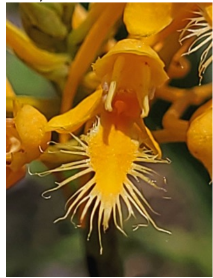
Platanthera x channelii

Yellow Fringed Orchids are the familiar Platanthera ciliaris . They are known to make hybrids with a number of white or yellow Platanthera species. When it hybridizes with the White Fringed Orchid, it produces Platanthera x bicolor , which can be anywhere from white to cream to buttery yellow to orange.