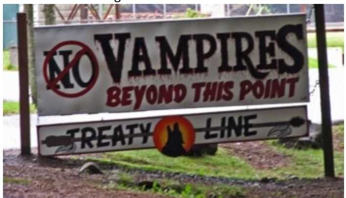
The logging city of Forks has taken the Twilight popularity in stride and have capitalized on it (see sign above as you head to La Push and the Pacific shores).