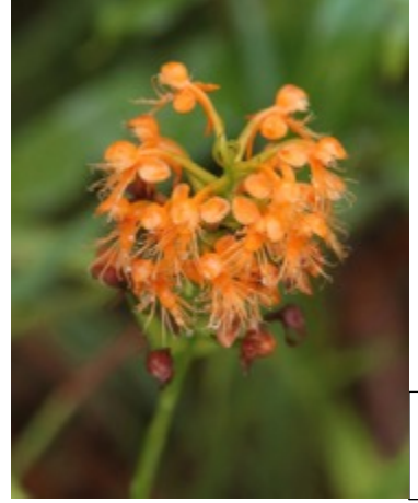
Platanthera cristata, Salisbury, Maryland

much deeper orange with larger petals and more fringe.