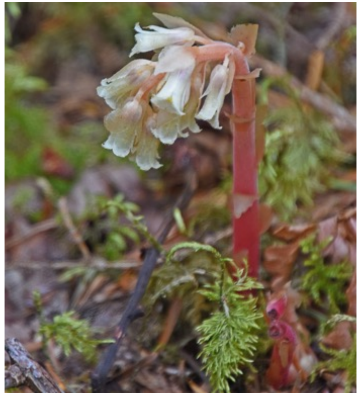
Red pinesaps (Monotropa hypopitys) in the area