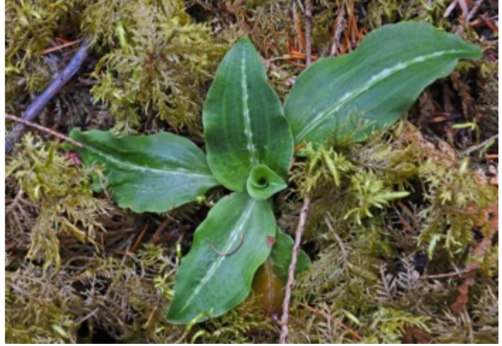
Giant Rattlesnake Plantain ( Goodyera oblongifolia ) growing on moss above a fallen tree trunk.