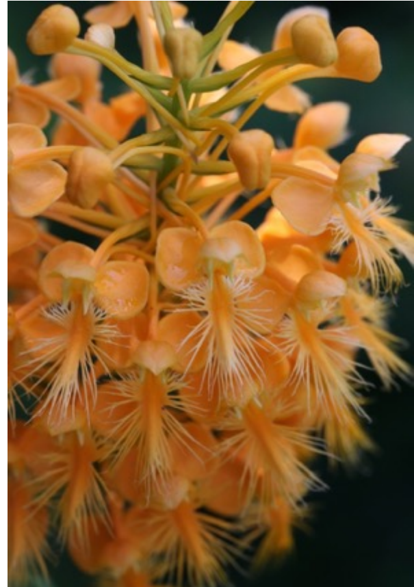
Platanthera ciliaris in Frederick, Maryland

Platanthera ciliaris is commonly called the Orange Fringed Bog Orchid, Yellow Fringed Orchid, but has a variety of other common names including Orange Plume, Bobwhite's Moccasin, Owl's Head, and Rattle Snake's Master. It is one of our most showy native orchids. It has synonyms of Blephariglottis ciliaris and Habenaria ciliaris with descriptions going back to 1753. Ciliaris is a Latin term meaning "like an eyelash" pertaining to its fringed lip. Cherokee Indians were said to use its flowers and pieces of the roots on their fishing hooks as bait. Other Native Americans used the roots to make a tea for medicinal purposes to treat headaches and diarrhea. Rattle Snake's Master's name was given in Florida as the roots were used both internally and externally to treat snakebite.