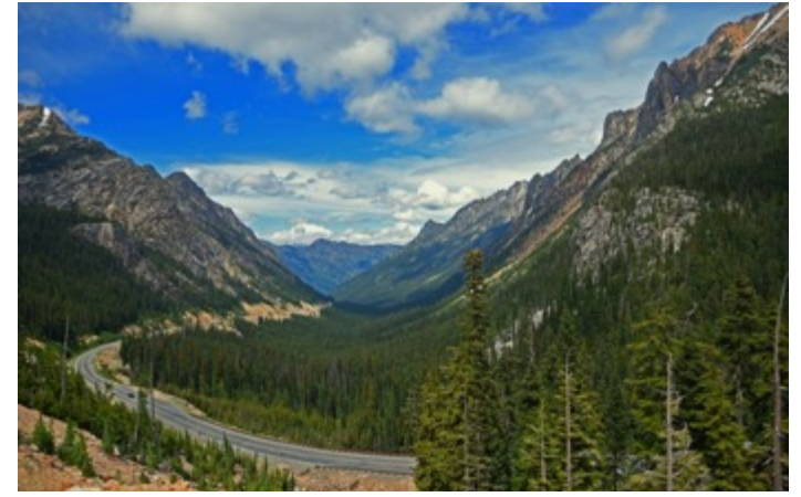
Washington Pass ( above ) is a high elevation road on the eastern side of the park, that looks down toward land east of the Cascades.

northern Rockies of Canada. The trail to see the Striped Coral Root is close by.