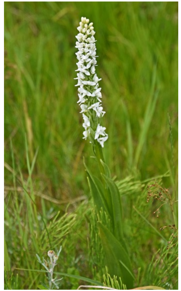
Tall White Bog Orchid (Platanthera dilatata)

Hidden further back, and I mean hidden in plain sight, are tall bog orchids with tall stalks of green flowers - the Slender Bog Orchid ( Platanthera stricta ) and possibly the Alaskan Orchid ( Platanthera unalascensis ). It is just amazing to see how tall they can get as they thrive on the clean cold waters.