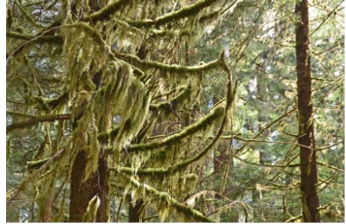
Trees with moss at the Hoh rain forest

Olympic National Park covers a big portion of the Olympic peninsula in Washington state, and in it, one can go from the Pacific Ocean coastline, to temperate rain forests, and up to alpine terrain. We may be familiar with tropical rain forests, but temperate rain forests are not very abundant.