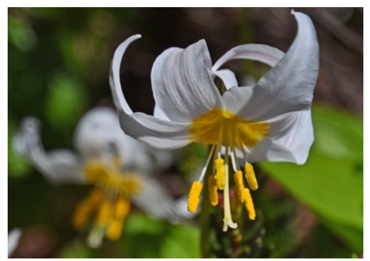
Think this is White Beauty (Erythronium revolutum).