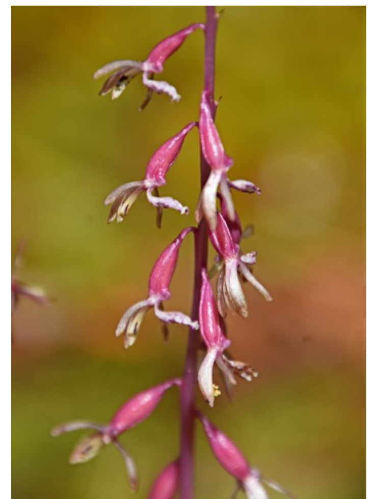
Western Coral Root (Corallorhiza mertensiana)

As you head to the western side of the park, you head into the temperate rain forests. In the Salmon Cascades area going toward Sol Duc, the naturalist said to look for native orchids there, and yes, they were there - Western Coralroot here and there, together with the parasitic Pinesap. There were a number of downed trees in the area, and with the water rushing downstream and crashing on rocks, the place was quite damp, and provided moisture for moss and plants.