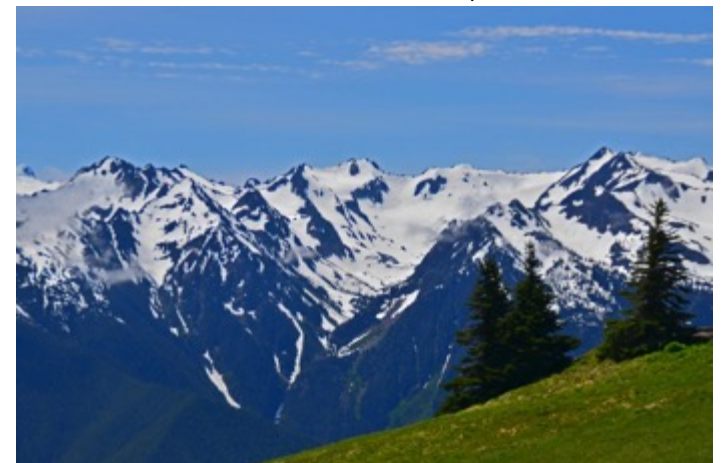
The Olympic mountains, from the Hurricane Ridge visitor center, at an altitude of 5,242 feet.

The Olympic mountains are tall mountains to the west of the Cascades, and a great view of these snow-capped mountains can be had from the Hurricane Ridge Visitor Center, a 45-minute (from Port Angeles) drive up a onelane road that usually punches through the cloud cover until you reach the Visitor Center - just make sure your lights are on if you are driving through the clouds as visibility drops significantly, but then as you go above the cloud bank, you get into sunshine.