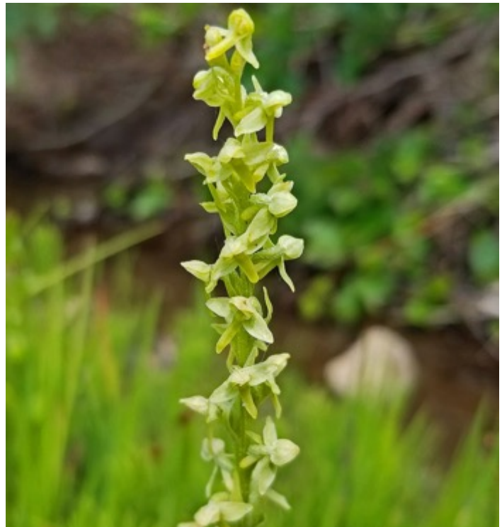
(these two orchid pics may be different orchid species would need an expert to identify..., but I think the lower one is the Slender Bog Orchid)