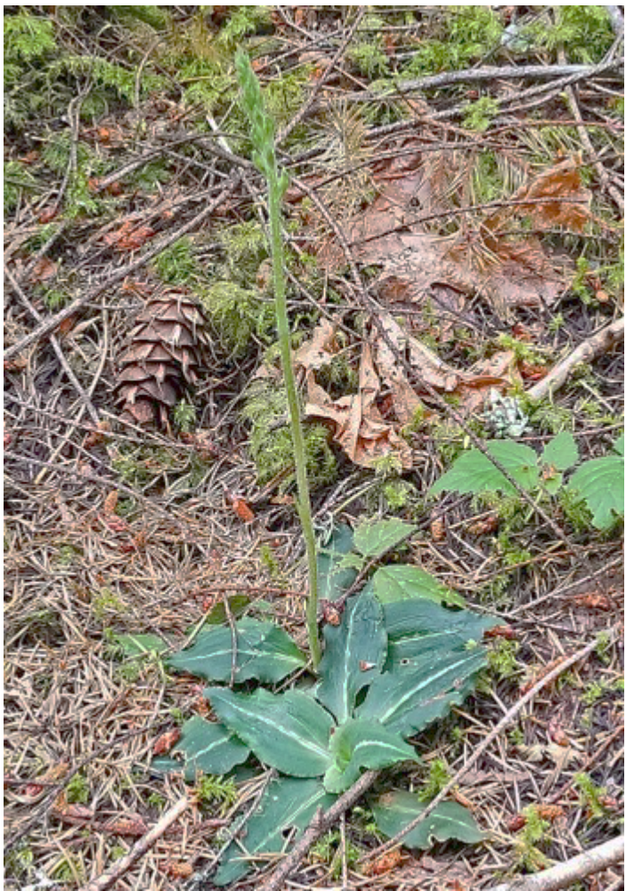
Giant Rattlesnake Plantains (Goodyera oblongifolia) in spike.