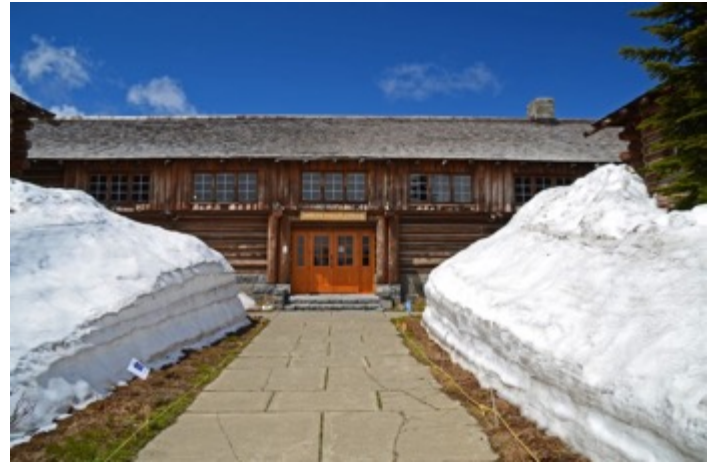
Sunrise Visitor Center, July 3, 2012

Aside from Olympic National Park, you can take side trips to a number of scenic spots in Washington state, including Mount Rainier National Park, where you can drive up close to the summit, at Sunrise Point visitor center (when I drove up here on July 3, it had just snowed overnight, so there was a thick snow pack, and the ranger started the fire in the fireplace to warm the center up - in the peak of summer!), and see a number of waterfalls, often with no name, as they are part of the snowmelt. There is also a part of the park on the west side that has a temperate rain forest.