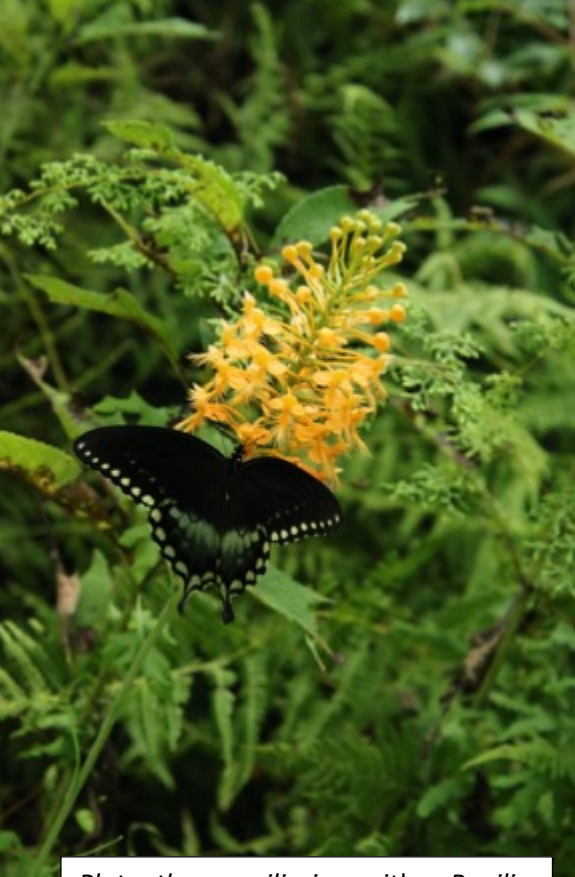
Platanthera ciliaris with Papilio polyxenes, Shawnee State Park