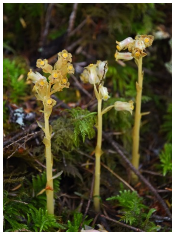
Yellowish Pinesap (Monotropa hypopitys)

Further down the road lay the Grove of the Ancients, where a number of old trees could be found. There is a nice hiking loop trail around the area, but the orchid I found here was not too far away from the parking pullout. You can easily miss it because they are quite small.