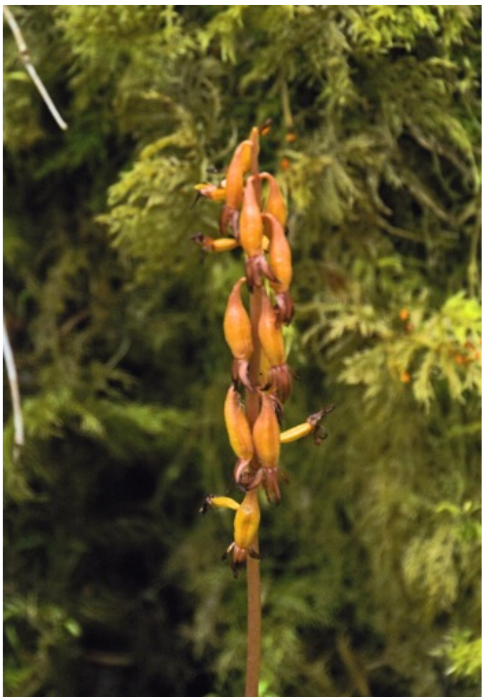
Likely Spotted Coralroot ( Corallorhiza maculata ) with seed pods. A number of coralroots were past prime across northern Washington state.