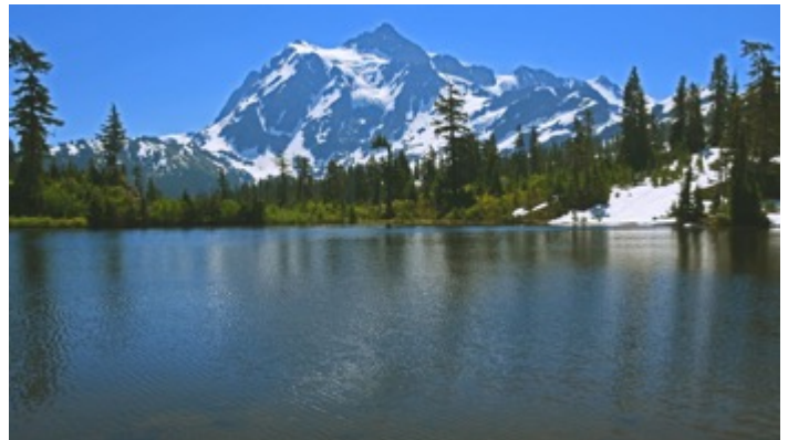
One is Mirror Lake, where you can see alpine wildflowers and snow-capped mountains (such as Mount Shuksan, above ).

North of the North Cascades National Park, and so close to the Canadian border that your cellphone tells you "Welcome to Canada", is the road to Mount Baker and Artist Point. Mount Baker is one of the tall volcanoes in the Cascades (which include Mount Rainier, Mount St Helens, and Mount Adams). Even in summer, the area still has glistening white snow packs. There are two very scenic areas here.