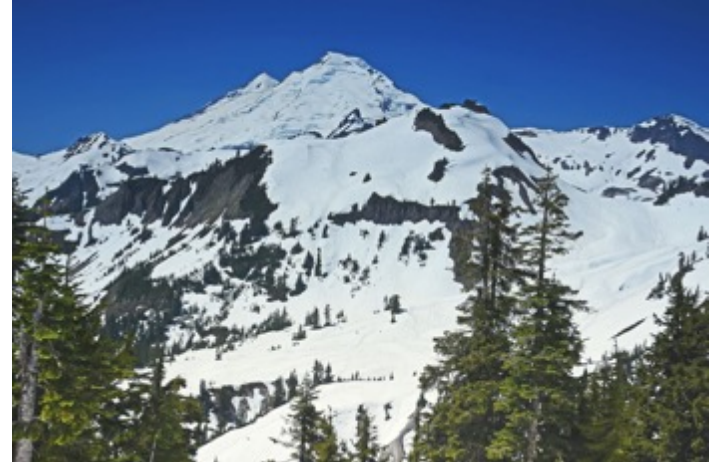
Mount Baker from Artist Point ( above ). Restroom at the parking lot ( below ).

Pushing further up brings you to Artist Point, where there is a parking lot and restrooms, and where you are at one of the highest elevations (more than 5,000 feet) in the area where you can bring a vehicle, giving you views of Mount Baker and Mount Shuksan.