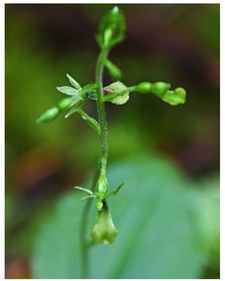
Northwestern Twayblade ( Neottia banksiana ). Only one plant had a flower open.

There were likely more native orchids as you head toward the Sol Duc waterfalls, but as it was getting late in the afternoon, I had to drive to Cape Flatery, where I would try to catch the sunset at the northwestern-most point int he continental US, and where I would stay the night.