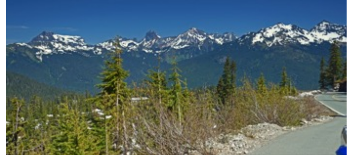
From a pullout on the drive ( above ) heading to Mirror Lake, you can see the North Cascades mountain range.

Pushing further up brings you to Artist Point, where there is a parking lot and restrooms, and where you are at one of the highest elevations (more than 5,000 feet) in the area where you can bring a vehicle, giving you views of Mount Baker and Mount Shuksan.