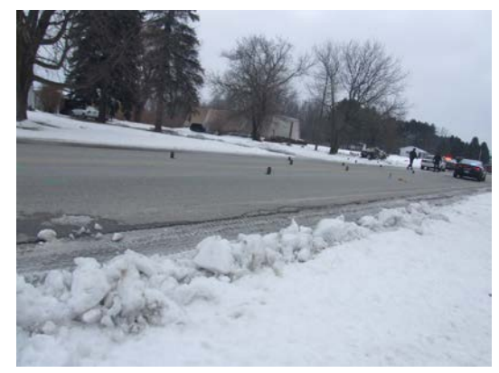
Figure 9. Photo. Photogrammetry

Average Cost: $1,000 to 4,000 with templates and software