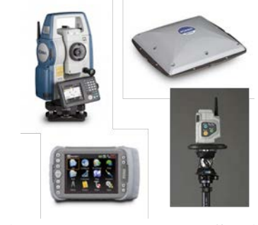
Figure 8. Photo. Total Station Hybrid

Reflectoriess range increases to 1000 meters.