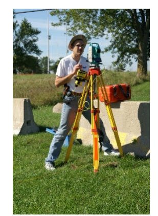
Figure 5. Photo. Reflectorless Total Station

In addition to the features from previous total stations, the Reflectorless Total Station allows for measurements to objects or points without placing an optical prism at those points. The process includes: pointing the instrument towards the relevant evidence point, aiming the crosshair at the object and pressing the data collector button to collect the shot. The reflectorless function of the EDM portion of the instrument permits distances to be measured well beyond normal crash scene distances. These instruments when first introduced allowed reflectorless measurements up to 350 meters or 1150 feet.