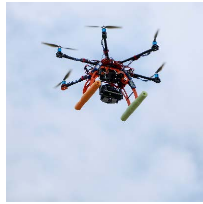
Figure 11. Photo. Unmanned Aerial Systems