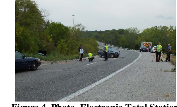
Figure 4. Photo. Electronic Total Station

Electronic Total Stations produced from 1990 to about 2000 are controlled by an internal microprocessor, allowing performance of a number of different measuring tasks. These tasks include staking out points, polar coordinate measurements, making calculations, and communicating data to a field data collector. This unit is infrared only and not capable of reflectorless measuring.