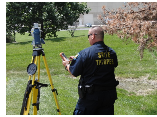
Figure 6. Photo. Semi-Robotic Total Station

Unassisted operation for measuring and recording of data. The Semi-Robotic Total Station seeks out an Active Remote Measuring Target (RMT), locks onto it, and follows movement between points. No fine adjustments or focusing are needed and there are no issues working in the dark. In most cases, it is possible to stake out and gather survey data as fast as the system can move.