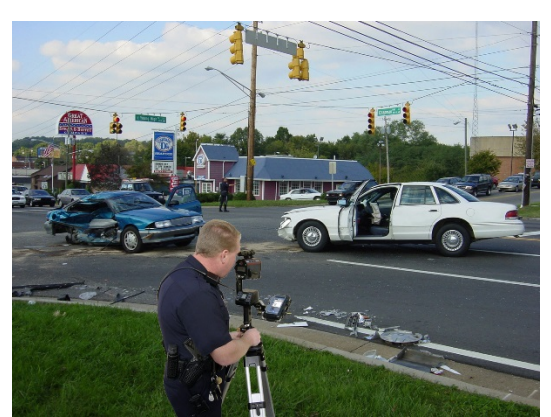
Figure 13. Photo. Light Detection and Ranging Systems

Average Cost: Approximately $7000 with the LiDAR, Angle Encoder and Software