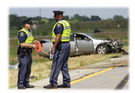
Figure 3. Photo. Mechanical Measurement Tool