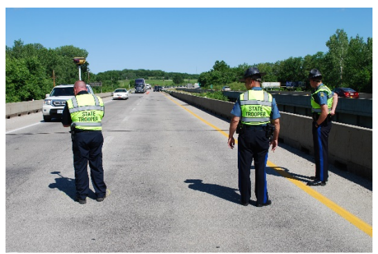
Figure 12. Photo. Global Positioning Systems