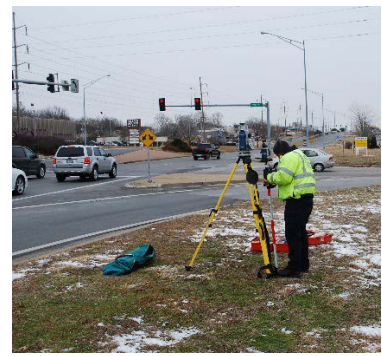
Figure 7. Photo. Robotic Total Station