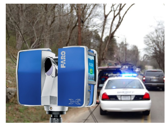
Figure 10. Photo. Three-dimensional Laser Scanning