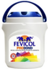
PVC & Acrylic Laminates