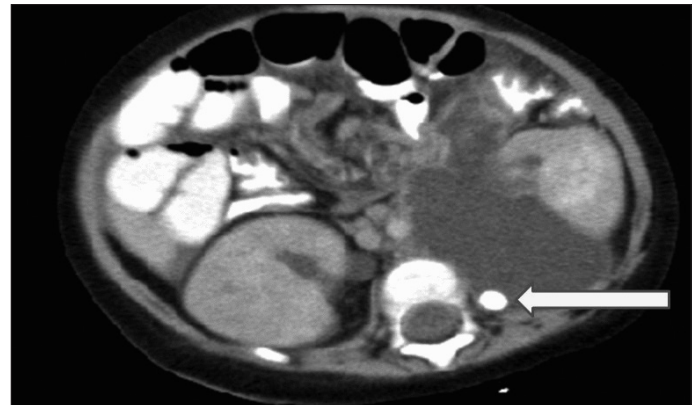
Figure 1. [Contrast-enhanced CT]. Arrow show left perirenal urinoma and an extruded calculus in the urinoma

Treatment of the urinary extravasation depends on the etiology and should be individualized in each case. Placement of a ureteral stent that splints the ruptured area may be used for initial treatment.