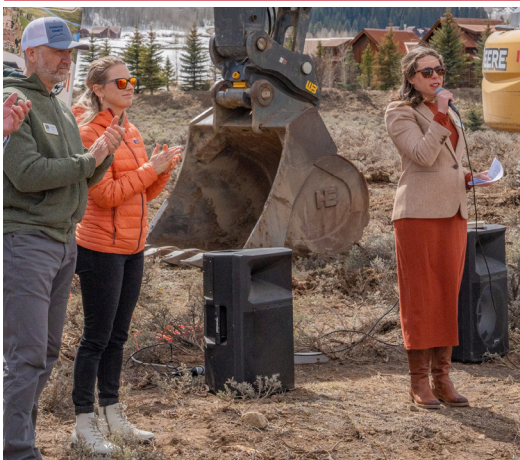
Whetstone Ground Breaking Site

The project will be all electric; built to Zero Energy Ready Code and will be solar ready. It will utilize a cutting-edge geothermal system and employ ground-source heat pumps to harness the heat transfer from the earth to meet heating and cooling demands, further reducing reliance on fossil fuels. This energy-efficient approach aligns with local, state, and federal initiatives aimed at reducing carbon emissions and increasing the use of renewable energy sources.