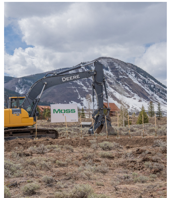
Whetstone Ground Breaking Site

Whetstone Village will set a new standard for sustainable and affordable workforce housing in Colorado, benefiting both local residents and the broader community.