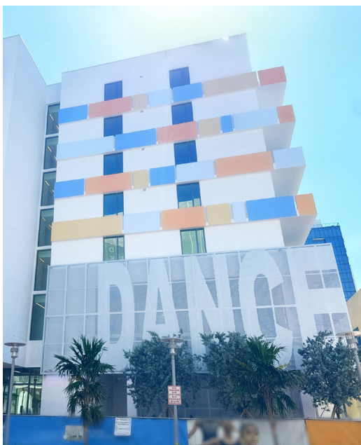
Exterior image of The Anamar at Collins Park

Our newest student housing project for NPC (a long-term partner), Redbud, will be having a ribbon cutting ceremony in late August. This new development will bring 200 student beds to the campus. Servitas is providing the full scope of development services including design, build, finance, property management operations, and maintenance.