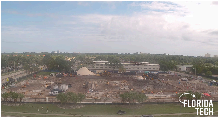
Florida tech Site- Top: 08/20/25 Bottom: 06/03/25