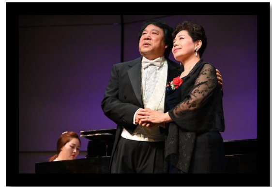
(A memory from "GREAT MOMENTS in OPERA and SONG")