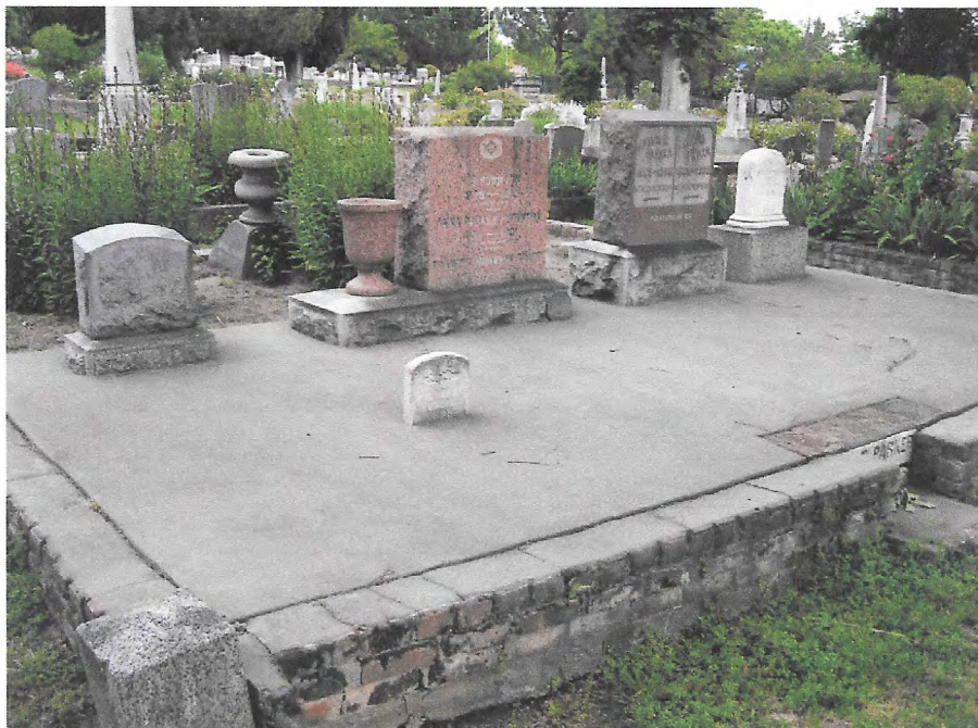
Parker/Shafer Family Plot in Sacramento City Cemetery