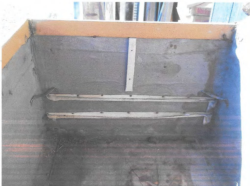
Inside with trays removed