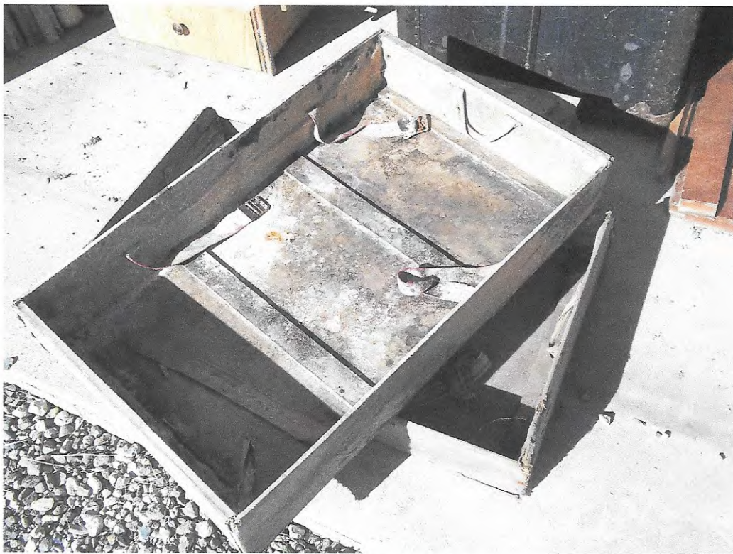
Two trays inside