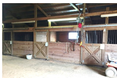
Safe stalls & working areas.