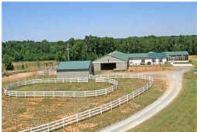
The barn is 105' x 50'

35.41 Acres. Approx 18 acres planted in pasture.