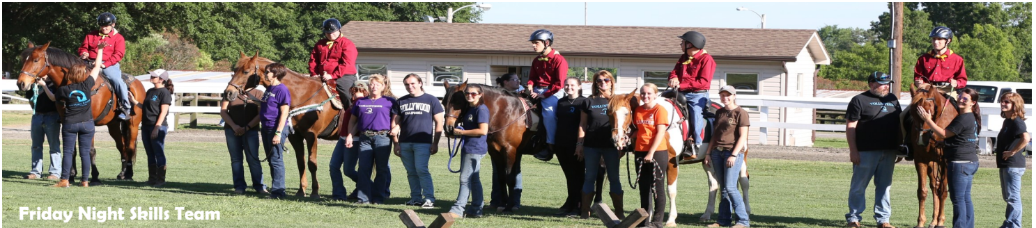
Friday Night Skills Team

Each year, 10-12 Victory Riders amaze and astound their families, the community, and themselves as they represent Victory Farm in the Dallas Horse Show at Biggerstaff Arena in Dallas, NC. These riders are an inspiration. They tackle the demanding tasks of riding and handling horses despite the challenges given by their bodies and minds. Victory Farm is a therapeutic and adaptive horseback riding program that works with children and adults with physical and mental disabilities. The Horse Show is a victory for all those associated with Victory Farm as our riders prove once again the power of determination and hard work. We are so proud of our champions!