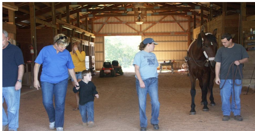
Walking out to Ride! You can see the Interior is large enough to ride inside year-round and during inclement weather