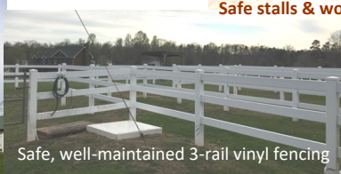
Safe, well-maintained 3-rail vinyl fencing