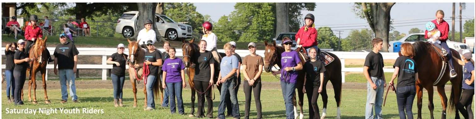
Saturday Night Youth Riders

None of this success happens without our village! So many of our regular and special project volunteers showed up to get horses and tack ready before the show and worked tirelessly during the show! We can't thank you all enough, for taking such good care of our riders and horses and giving them this opportunity! Please visit our Facebook page for more photos!