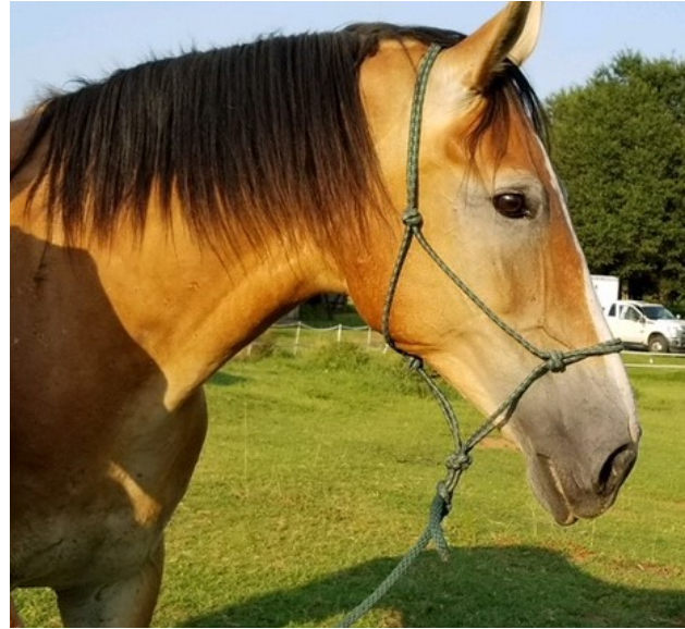
"Miss Kate" will also be carrying our larger riders in the Therapeutic & Adaptive Riding Programs