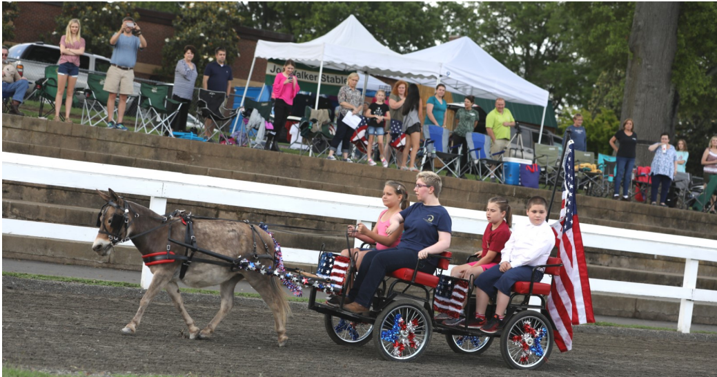
Pictured Above & Right: Strawberry the Mini-Mule proudly carries her friends from Victory Farm at the Dallas Horse Show Opening Flag Ceremony, Memorial Weekend.