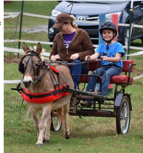
Above: Our current driving program with Strawberry the Mini-Mule

This program will help drivers of all ages and ability levels improve their physical, mental & emotional well being.