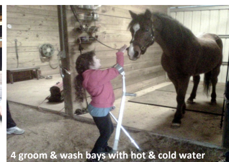
4 groom & wash bays with hot & cold water