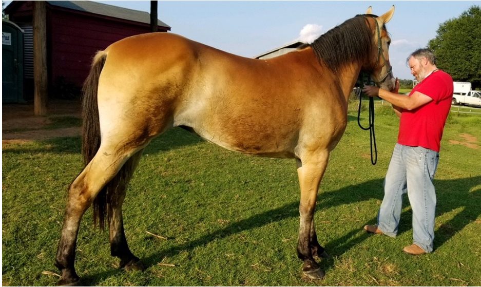
From a rescue situation, this kind & thoughtful Amish-bred Belgian cross mare is ready to serve