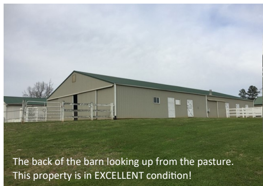
The back of the barn looking up from the pasture. This property is in EXCELLENT condition!

Children & adults with physical & cognitive challenges need consistent riding to ease pain, increase mobility, develop form and function. (ie, cerebral palsy) For riders with autism, ADHD, anxiety disorders and related challenges, consistent riding aids sensory integration, patience, discipline, and social skills supporting a healthier academic and family environment.