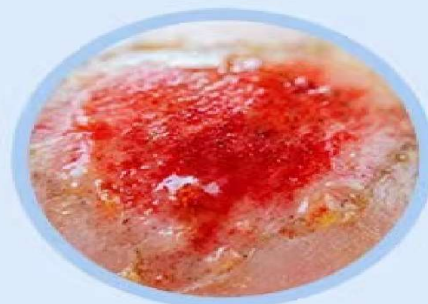
When Poor Wound Healing