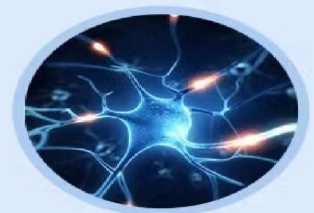
Improve nervous system function