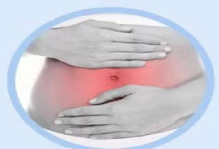
Chronic (PID) Pelvic inflammatory disease