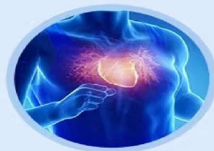
Promote Blood Circulation