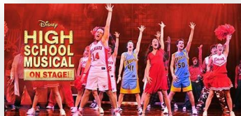
Cherokee High School Spring Musical "High School Musical"