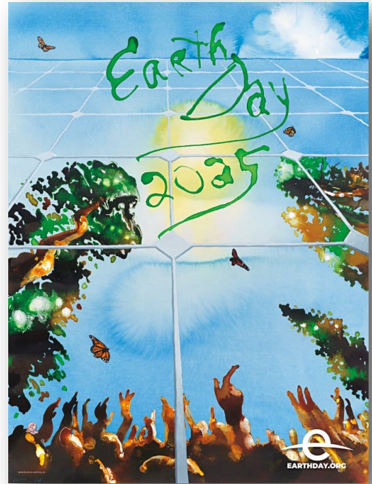
April 22, 2025 is Earth Day

Contact: Genni Fardella ~ (856) 278-4880 genni@marltonwomansclub.com