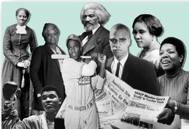
Celebrating Black History Month throughout the month of February