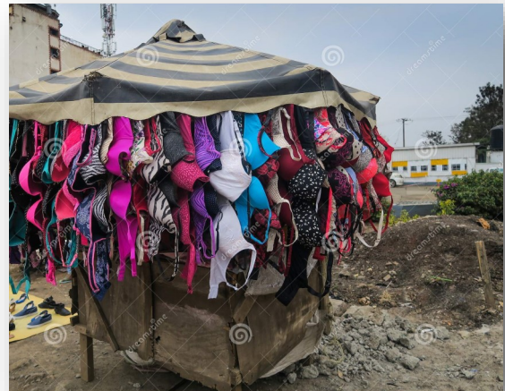
This picture is from Nairobi, Africa showing an outdoor bra market.

Trafficking survivors need a dignified way to make money while transitioning from exploitation to the rest of their lives.