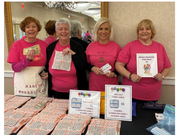
Ticket sales were brisk this year! Over 200 people attended our Fall Bingo. Well Done! Yet another SOLD OUT ballroom at Indian Spring!