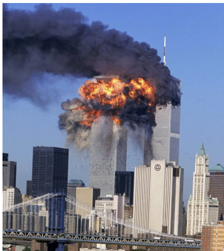
Remembering September 11, 2001 and the attack on America. Where were you?