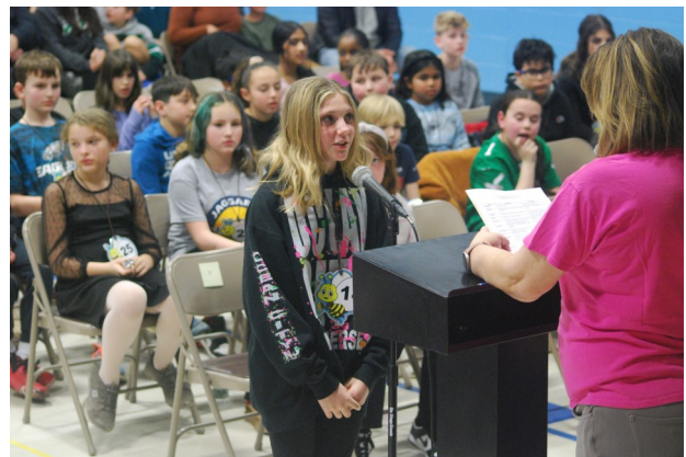
10th Marlton Woman's Club Spelling Bee Van Zant School