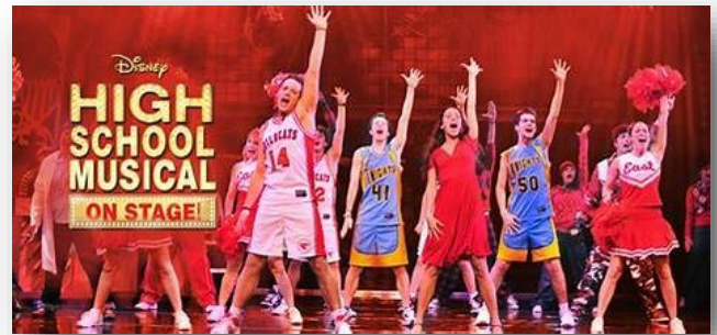
Cherokee High School Spring Musical “High School Musical” We’re all in this together!

zeets1@comcast.net ~ (609) 828-6505 cell