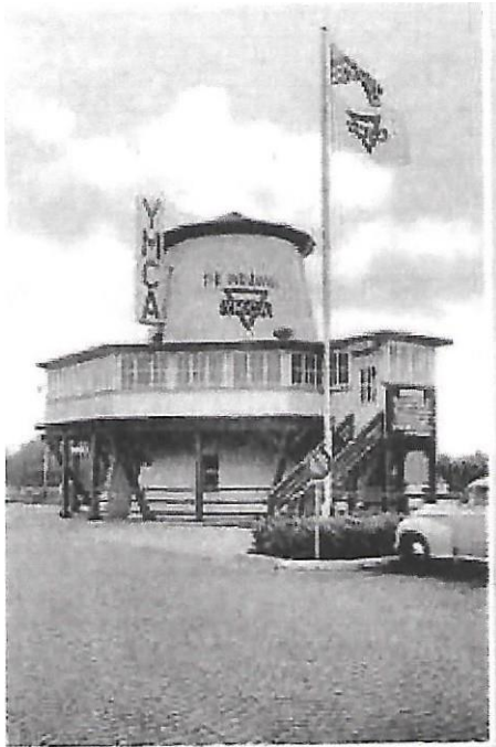
THE ONLY BRITISH Y.M.C.A. CANTINEEN ON AUTOBAHN