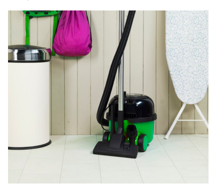
Stores Neatly Away On-board tool storage means tools are always to hand and neatly packed away.