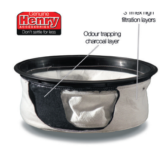
MicroFresh Filter for PetCare Order Code 604170