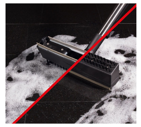
Perfect for wet vacuum The combination of our highly efficient turboflo vacuum turbine and the power flo pump system provides you with professional cleaning anytime, anywhere, providing exceptional results.