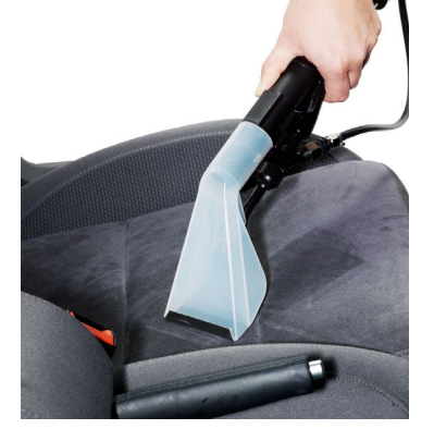
The "George" is the most useful and versatile 3 in 1 carpet cleaner for cleaning carpets and upholstery.