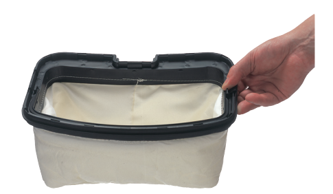
The combination filter provides 0.3 micron filtration at 99.97% efficiency