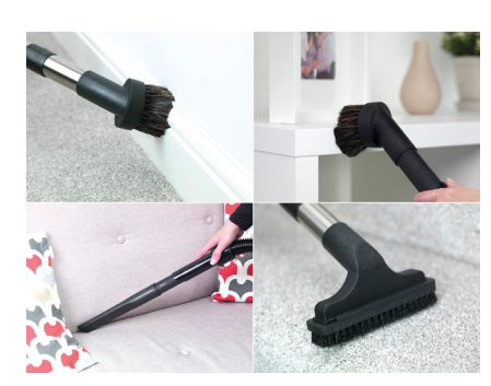
Ultimate All-rounder Carpets, hard-floors, cars, stairs, DIY... nothing beats a Henry for versatility.

XTRA Turbo Kit: Ideal for homes with hardwood floors and more carpet