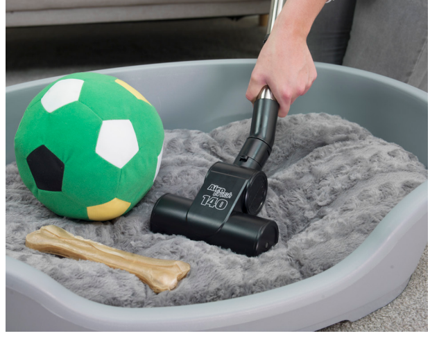
Reduce Pet Odours Charcoal activated MicroFresh filter tackles lingering pet odours, meaning what goes in, stays in.

Perfect for Pet Owners HairoBrush easily picks-up stubborn pet hairs from carpets and stairs.