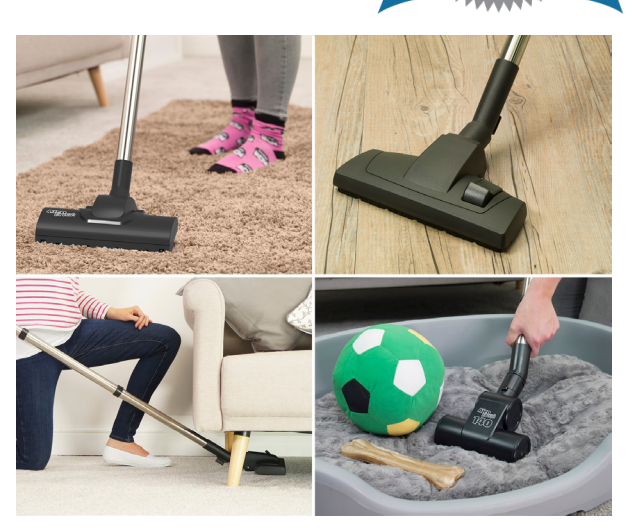
Powerful Cleaning Powerful, efficient and long-life cleaning technology.