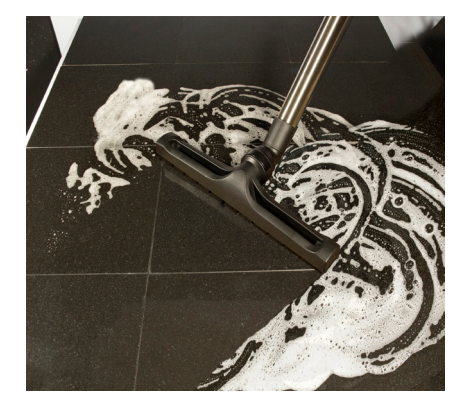
A Tool For Every Job Professional wet and dry accessory kit with stainless steel wand set

Order Codes: (CV 570) BB8 kit/ Standard kit 903566