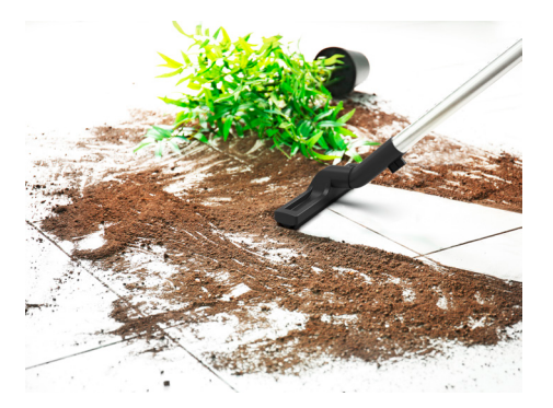
Specialist Hard-Floor Tool Lightweight, powerful in use, and engineered to provide peak suction performance on hard-floors, including laminate, tiles and wood.