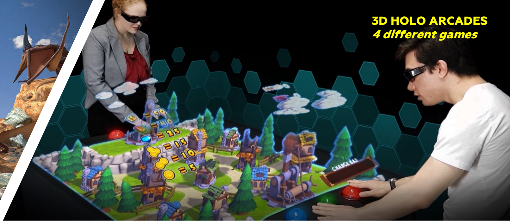
3D HOLO ARCADES 4 different games