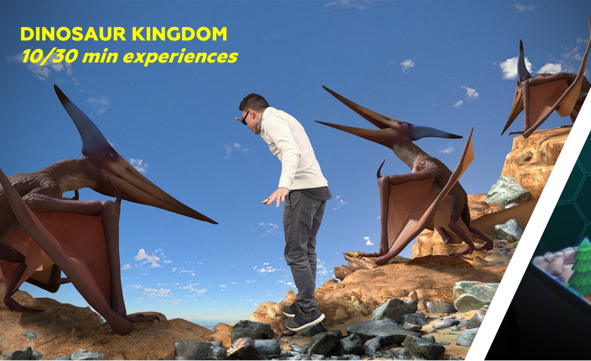
DINOSAUR KINGDOM 10/30 min experiences