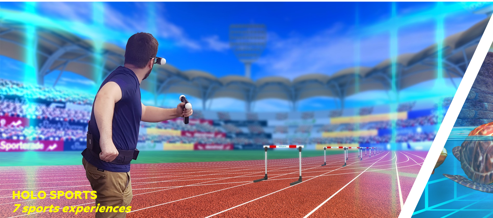
HOLO SPORTS 7 sports experiences