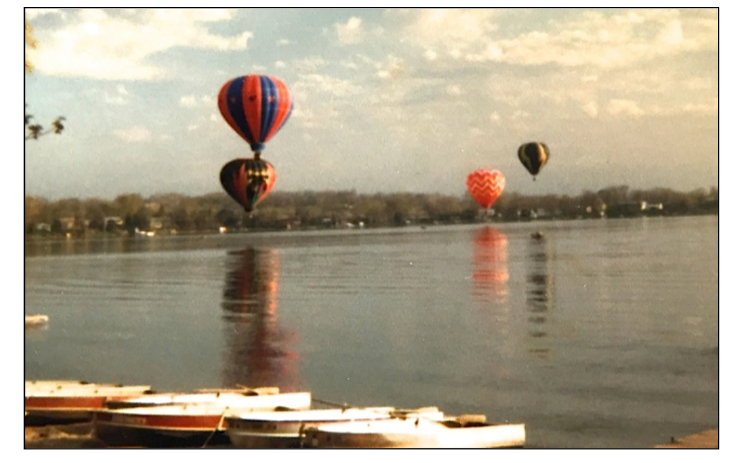
Hot Air Balloons over Spring Lake circa 1960's. See more historical pictures inside as well as at www.springlakeassociation.org

They also plan to have special guests to further educate members on what is happening in and around the lake. They hope to see you there.