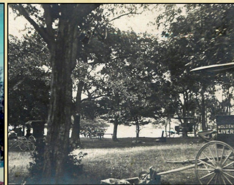
McKennet's Resort picnic grounds