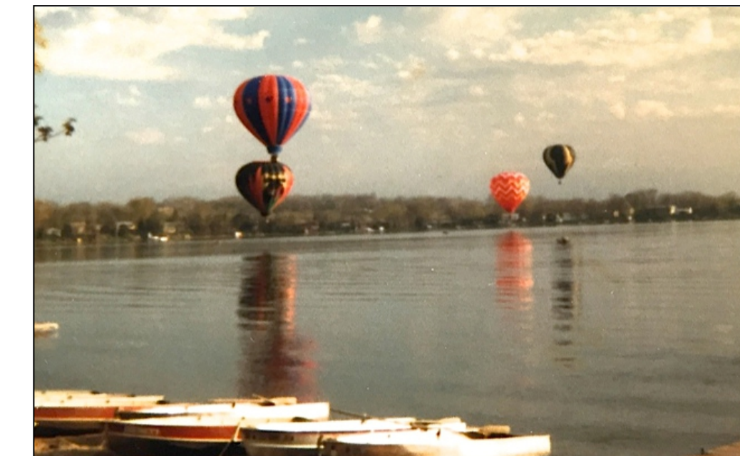
Hot Air Balloons over Spring Lake circa 1960's. See more historical pictures inside as well as at www.springlakeassociation.org

They also plan to have special guests to further educate members on what is happening in and around the lake. They hope to see you there.