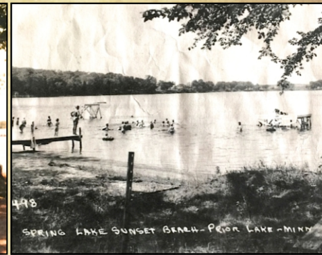
Sunset Beach Resort