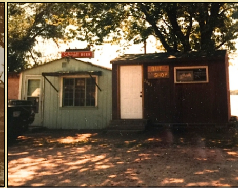
Craig's Resort, bar and bait shop