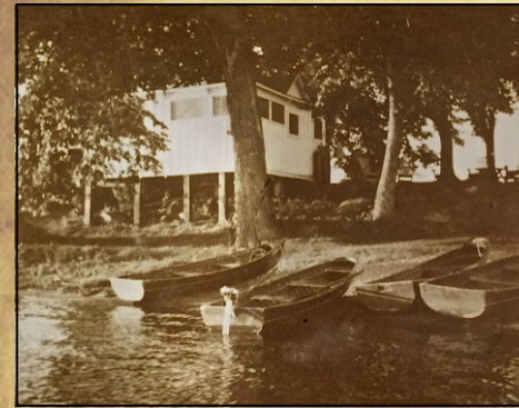
Craig's Resort, cabin #5