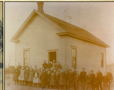
Spring Lake public school