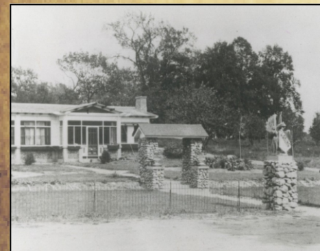
Dr. Larson's Resort (Hollywood Inn)