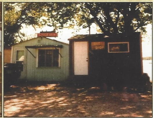
Craig's Resort, bar and bait shop

Craig's Resort Property was comprised of five cabins, a bar, bait shop and a lakeshore dock with a swimming beach and raft. Craig's Resort occupied addresses 2883—2855 on Spring Lake Road.