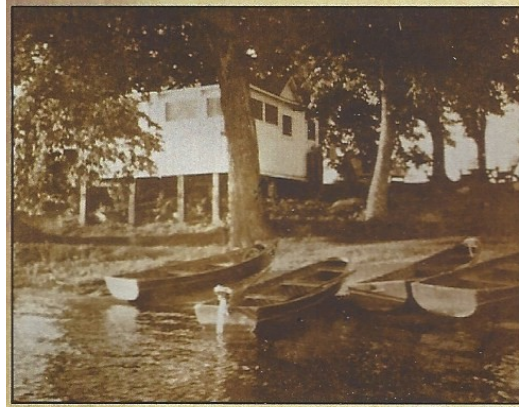
Craig's Resort, cabin #5