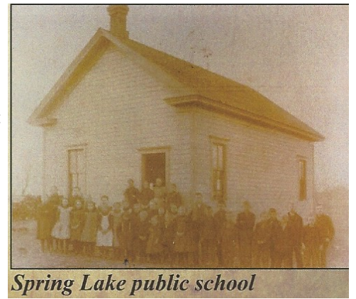
Spring Lake public school