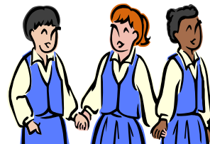
Kids' Choir Club Wednesdays, 4:00 - 5:30 pm