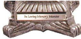
Sm. Pedestal Memory Lamp

If you would also like a nameplate on your candle, please use the attached order form for the candle size and shape that you select and then email or mail to: