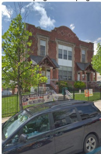
16 Osgood Ave Staten Island, NY 10304 PH: 718-420-6138 Fax: 420-625/