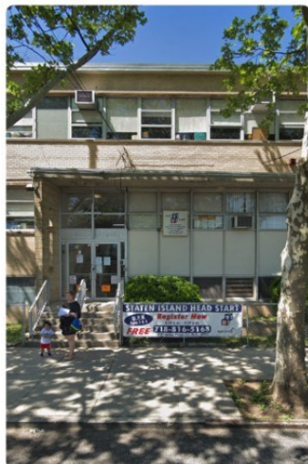
10 Kinsgley Place/100 Brighton Ave Staten Island, NY 10303 PH: 718-816-5168 Fax: 718-816-4238

Each of our Head Start centers is located in different communities. Recruitment is a year round process with special intensive drives in the late spring to ensure full enrollment during the summer and in the early fall. Staten Island HS/EHS recruits children from a pre-determined catchment area. Selection of the target area is based on the Community Needs Assessment and covers an area in the approximate vicinity of the program site. Families who reside outside of our catchment area will be considered for placement if there is no Head Start where they live and space is available in our program. Our program must have a minimum of 90% eligible children.