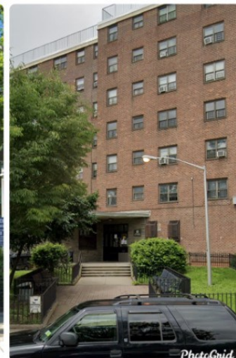
166 Lockman Ave Staten Island, NY 10303 PH: 718-494-0400 Fax: 494-4464