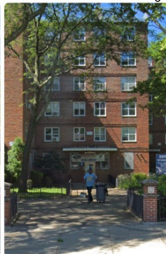
44 Dongan Hills Ave Staten Island, NY 10306 PH: 718-987-7755 Fax: 987-2909