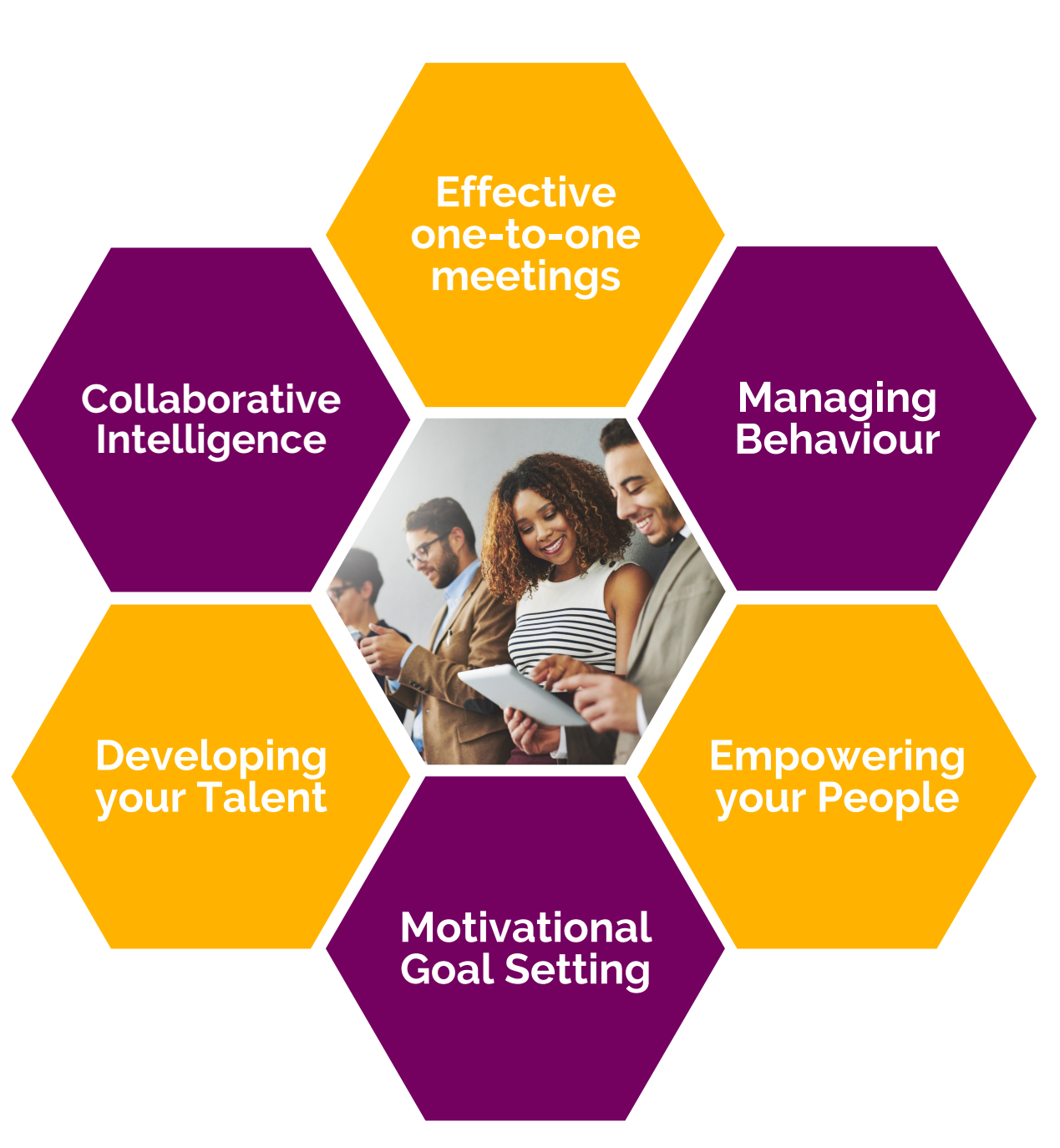
A selection of our interactive workshops to drive, motivate and inspire.

E P I C Engagement is an innovative solution for driving employee engagement. It should be considered as a crucial diagnostic and measurement aid for one of the most important business metrics to your organisation's performance and productivity Employee Engagement. What separates E P I C Engagement from any other engagement model? It gets to the heart of those aspects of your organisation where the issues lie. If you are clear on what your employees are not engaged with and the cause of this disengagement, then your time can be focused on removing those obstacles in a sustainable fashion.