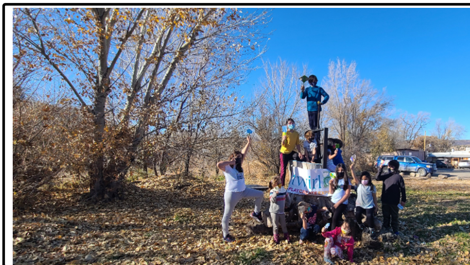
Yay! It's time to learn, create, and play with Twirl of Taos.