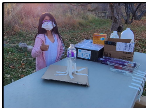
Learning science is fun – and exciting, too. As when we learn how to turn a plastic bottle into an erupting volcano.