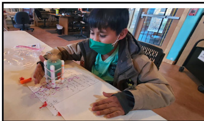
Look at my gadget go! How cool (and colorful) is that?