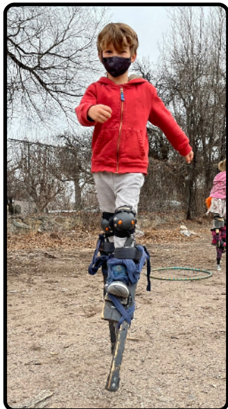
Showing skill on stilts.