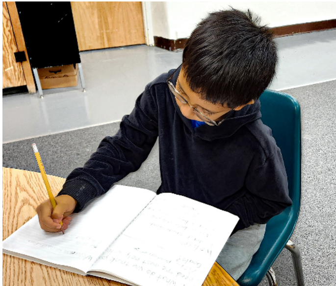
A student writes in his journal.