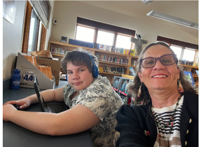
Writing Lab tutoring prepares an 8th grader for high school writing.

What was making learning hard for you before? "Well, my best friend was moving away so I was sad and I was having a hard time socializing. Tutoring helped me get out of my comfort zone and learn to socialize and I've made new friends at school. Also, tutoring helps me focus."