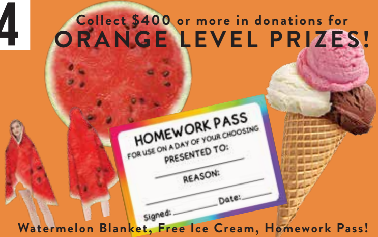
Watermelon Blanket, Free Ice Cream, Homework Pass!

4 Collect $400 or more in donations for ORANGE LEVEL PRIZES!