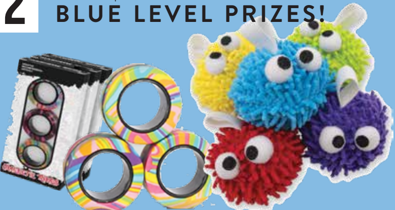
Magnetic Ring Fidget Toy, Monster Dry Erasers

2 Collect $150 or more in donations for BLUE LEVEL PRIZES!