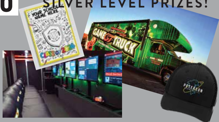
Game Truck during recess plus a 24/25 yearbook or spirit wear!

6 Collect $850 or more in donations for SILVER LEVEL PRIZES!