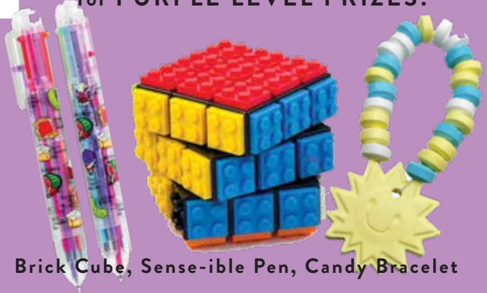
Brick Cube, Sense-ible Pen, Candy Bracelet

1 Collect $75 or more in donations for PURPLE LEVEL PRIZES!