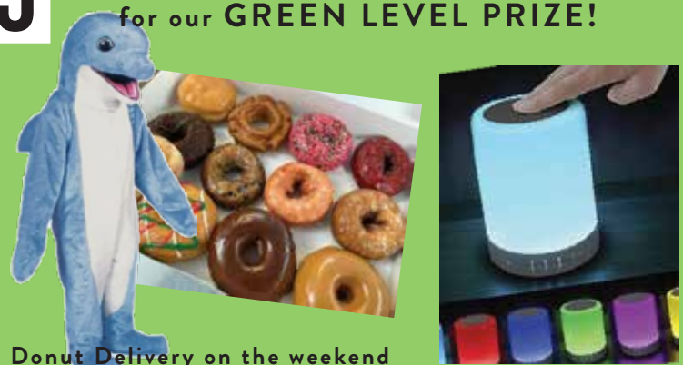
Donut Delivery on the weekend from JP the Dolphin and Touch Bedside Lamp

5 Collect $600 or more in donations for our GREEN LEVEL PRIZE!