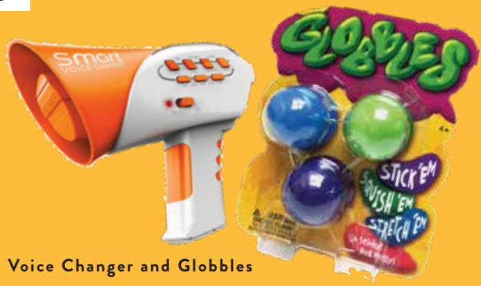
Voice Changer and Globbles

3 Collect $250 or more in donations for YELLOW LEVEL PRIZE!