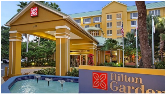
Hilton Garden Inn Fort Lauderdale

Did you know that Cherie is a Fort Lauderdale Specialist? Well, now that you do, let us help you plan a getaway to Fort Lauderdale, or checkout the city when you cruise from the Port Everglades port. Take some time for a pre- or post-cruise stay, and see why we think you will LOVE Fort Lauderdale. It's convenient for travel to Miami or any of the surrounding cities. Contact us to learn more!