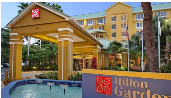
Hilton Garden Inn Fort Lauderdale

Did you know that we can assist you with tickets to a concert, game, theatre event and more? Well, now we can, thanks to our affiliation with Golden Tickets! Click to visit our site, or contact us to plan for your next outing.