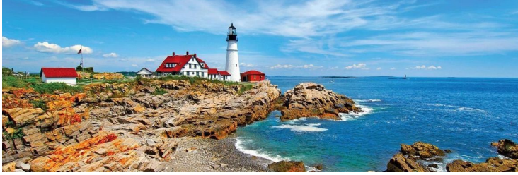
Cherie's World Travel

Monday is Labor Day?! Where have the days gone? Students are back in school, the summer is almost over, and the holidays will be here before you know it. Whew!