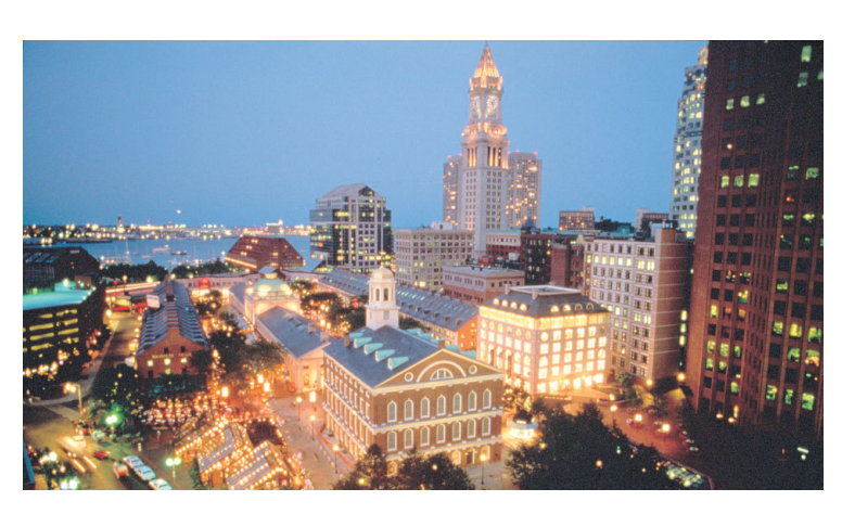
BOSTON ULTIMATE GETAWAY

Discover all that the city of Boston as to offer on this four-day adventure! Steeped in history, the city of Boston, nicknamed "The Cradle of Liberty," will be a prized destination for anyone