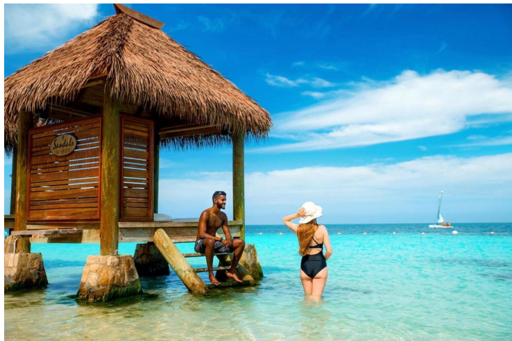
Sandals Montego Bay

Sandals Montego Bay is one of the island's most playful and captivating hideaways set along the best private white-sand beach in Jamaica, where offshore reefs create the calmest waters for leisure swims.