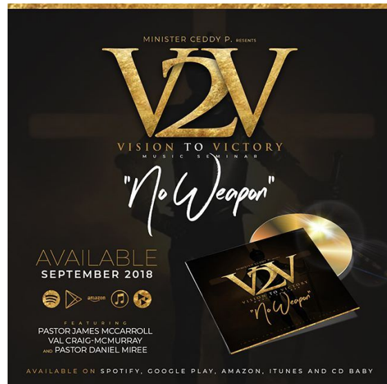
V2V - Ceddy P Productions

V2V first began as a workshop with a choir presentation and album at the end, and has now evolved to a solid group of singers, of which Cherie is a part. Their single, No Weapon , from the soon coming second album, was recently released and is available for download.