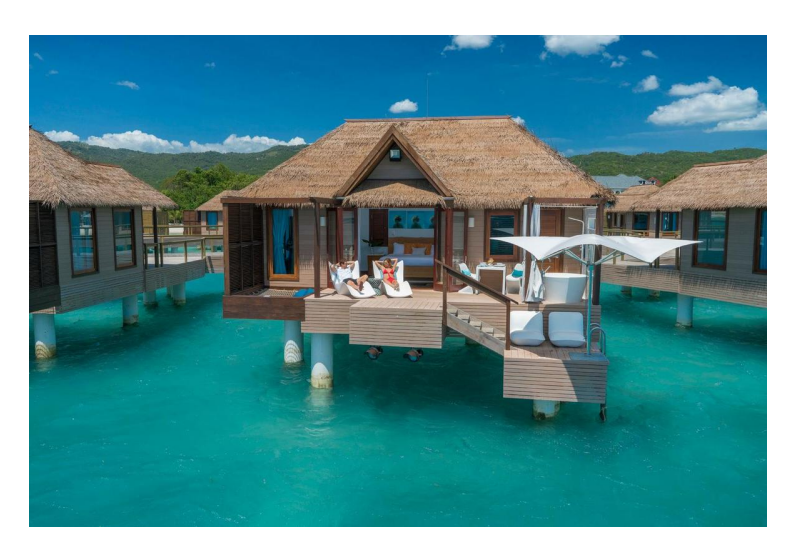
Sandals South Coast

Discover Jamaica's only all-beachfront, alloceanview resort set on a 500-acre wilderness preserve. Sandals South Coast brings guests closer than ever to the water, featuring Over-The-Water Bungalows, Latitudes ° Over Water Bar, an Over-The-