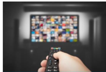
World Television Day 2023 November 21

How did you spend World Television Day on November 21? Were you so distracted with food and/or hosting preparations for Thanksgiving that you didn't even notice?