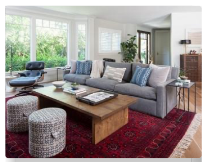
10 times to hire an interior designer Posted Oct 16 at 5:00 AM