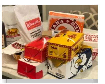
Our definitive list of the best Southern fast food fried chicken Posted Oct 17 at 8:00 AM