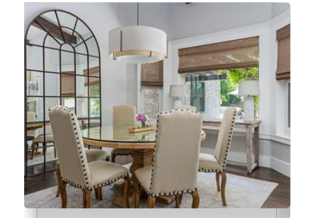
How to shop for furniture online — and get what you pay for Posted at 5:00 AM