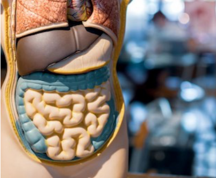
Top Gut Doc: How To Cleanse Your Bowels (You Won't Believe Step 1) United Naturals