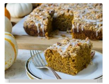
Chock-full of pecans and topped with a crumbly streusel, this pumpkinfilled snack cake will... Updated Oct 16 at 2:51 PM