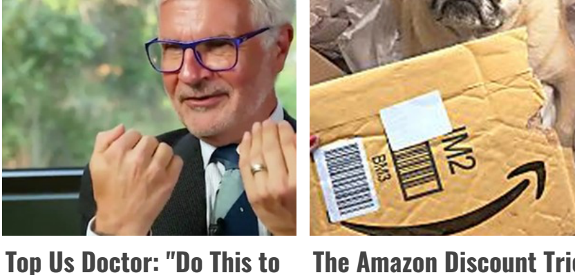
The Amazon Discount Trick Most People Don't Even Know About