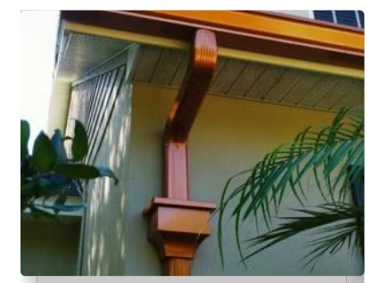
Seamless guttering pros, cons and materials Posted Oct 15 at 5:00 AM