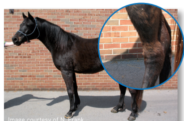
Patches of longer coats are early signs of PPID