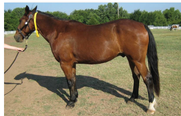
After 6 months treatment with Prascend®