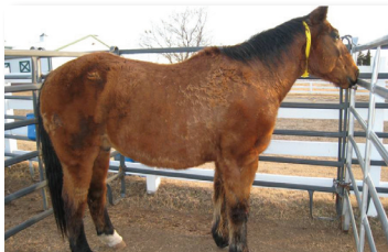
At PPID diagnosis

Usually there is a short lag between the beginning of treatment, and seeing your horse return to normal in terms of clinical signs. Those will improve generally within 6–12 weeks after initiation of the treatment. However, it can take up to a year to see the full benefit of treatment.