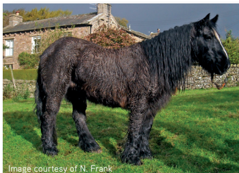
Late stage hirsutism

This ranges from mild changes in coat shedding, right through to a full, long, curly, overgrown coat ('hirsutism'). The presence of hirsutism is thought by some experts to be the most reliable single indicator of underlying PPID, although not all horses with PPID develop this symptom, especially in the early stages of PPID.