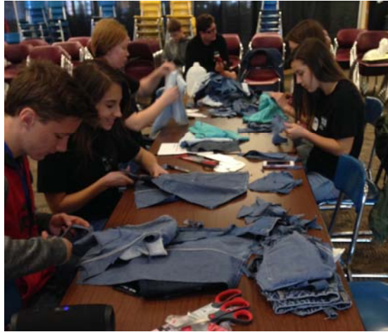
Medina County students cut denim during the Youth Day of Action to be shipped to Uganda, Africa for the Sole Hope project.